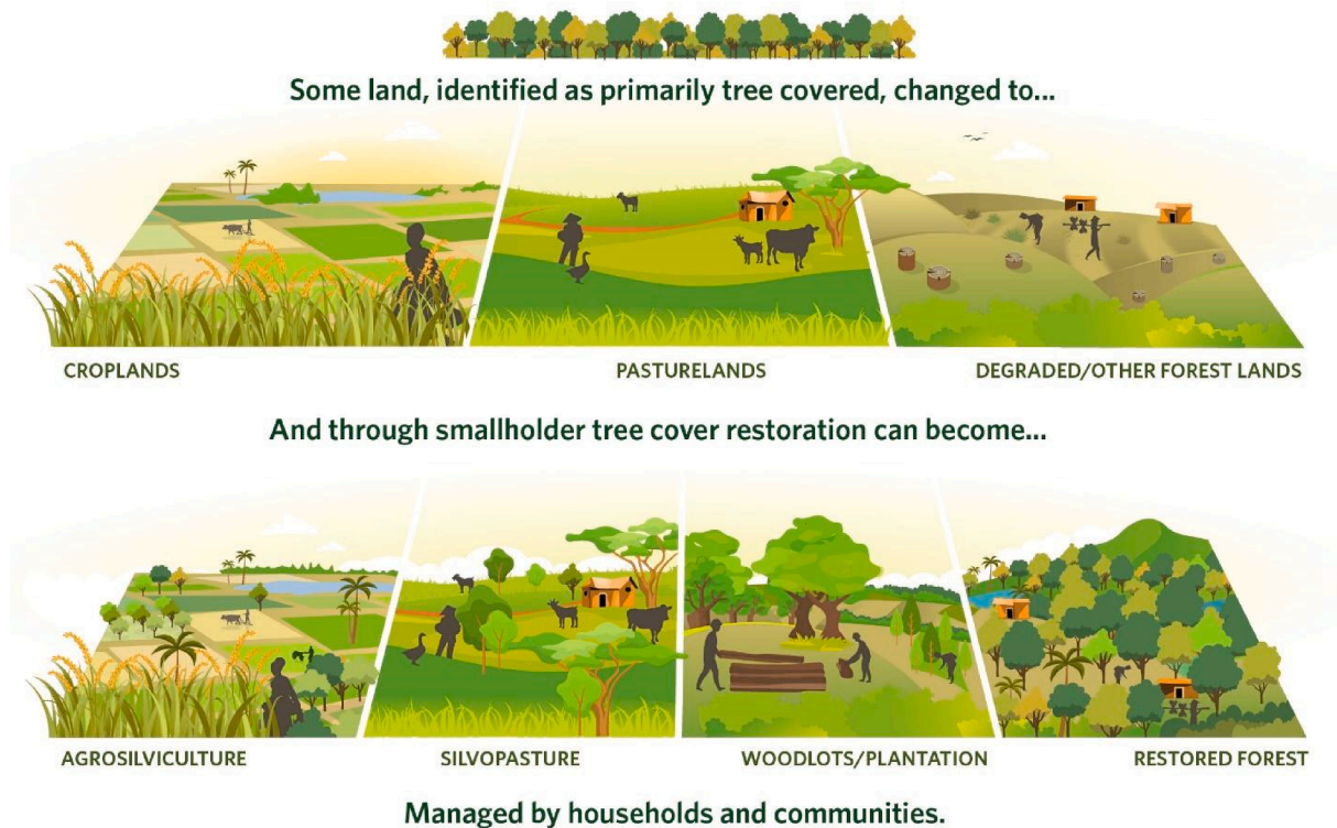
Fig. 1. A depiction of how forestlands that underwent land use change to become croplands, pasturelands, or degraded forestlands can incorporate smallholder tree cover restoration to become agrosilviculture, silvopasture, woodlots or plantations, or restored forests.

To estimate area and population totals on low-cost restorable lands in crops, pasture, or degraded forest, we intersect the Busch-Erbaugh data with data on the extent of croplands (Fritz et al., 2015) and pasturelands (Ramankutty et al., 2008), which are both 1-km resolution resampled to ~5.5 km 2 grid cells. We avoid double-counting by excluding cropland from the resampled pastureland data, which are less recent and have lower resolution than the cropland data. We identify degraded forestland as areas in the Busch-Erbaugh data that are potentially restorable and are not used for crops or pasture, noting that our definition of degraded forestland excludes grid cells that lost forest cover prior to 2000, i.e., forest areas that were already degraded below 30 % forest cover by 2000. While we refer to this area as degraded forestland, we recognize that it might include smaller mosaics of land uses (e.g., small habitations, or small tracts of cropland, pastureland, recovering forests, or shifting cultivation) in addition to degraded forestland. Within countries, we calculate zonal statistics for the areas