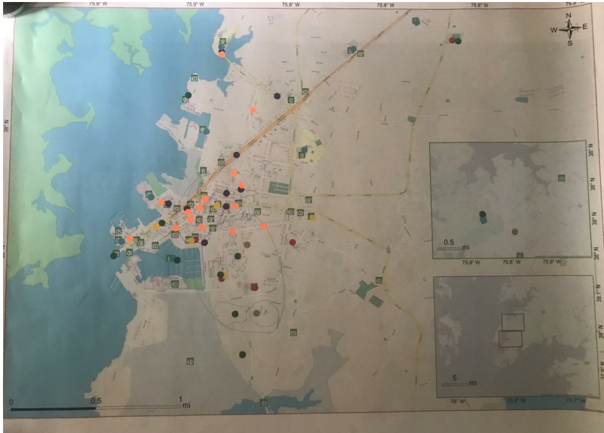
Figure 1: Group 1 Map