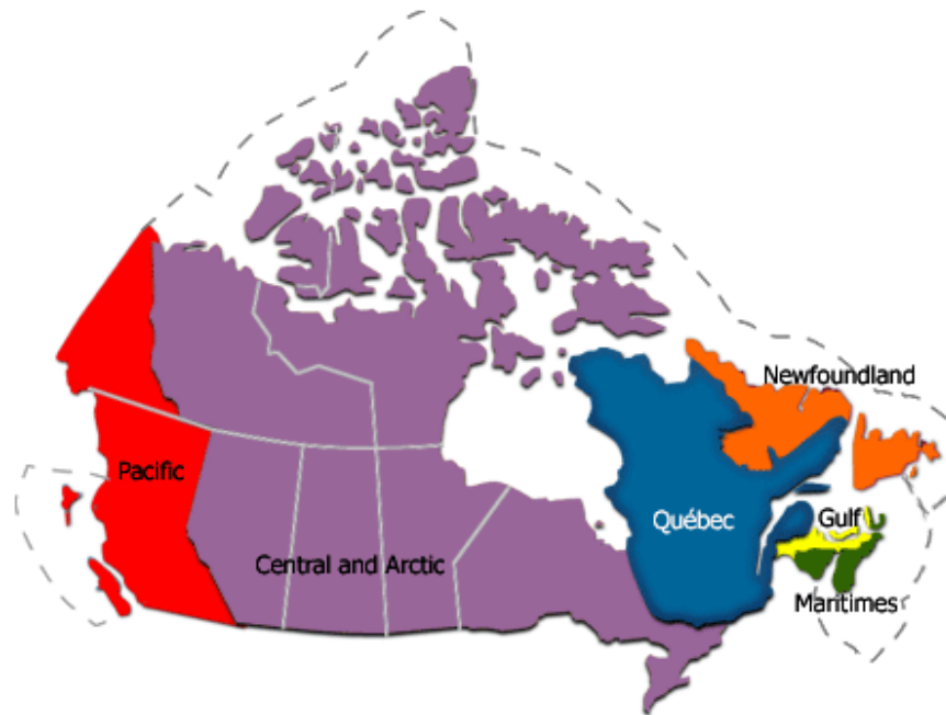
Figure 1: Map of the various DFO Regions in Canada.