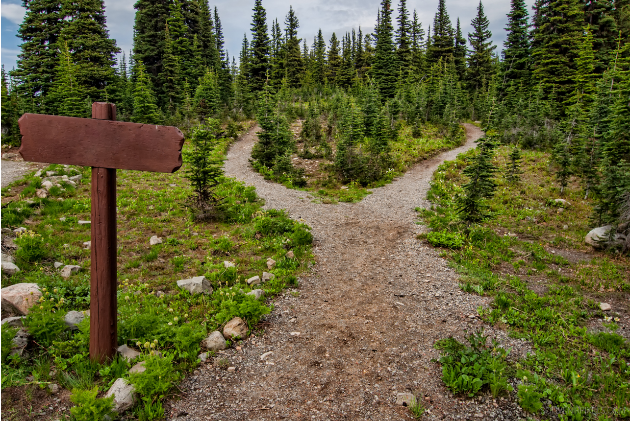
Okanagan-Similikameen, BC.