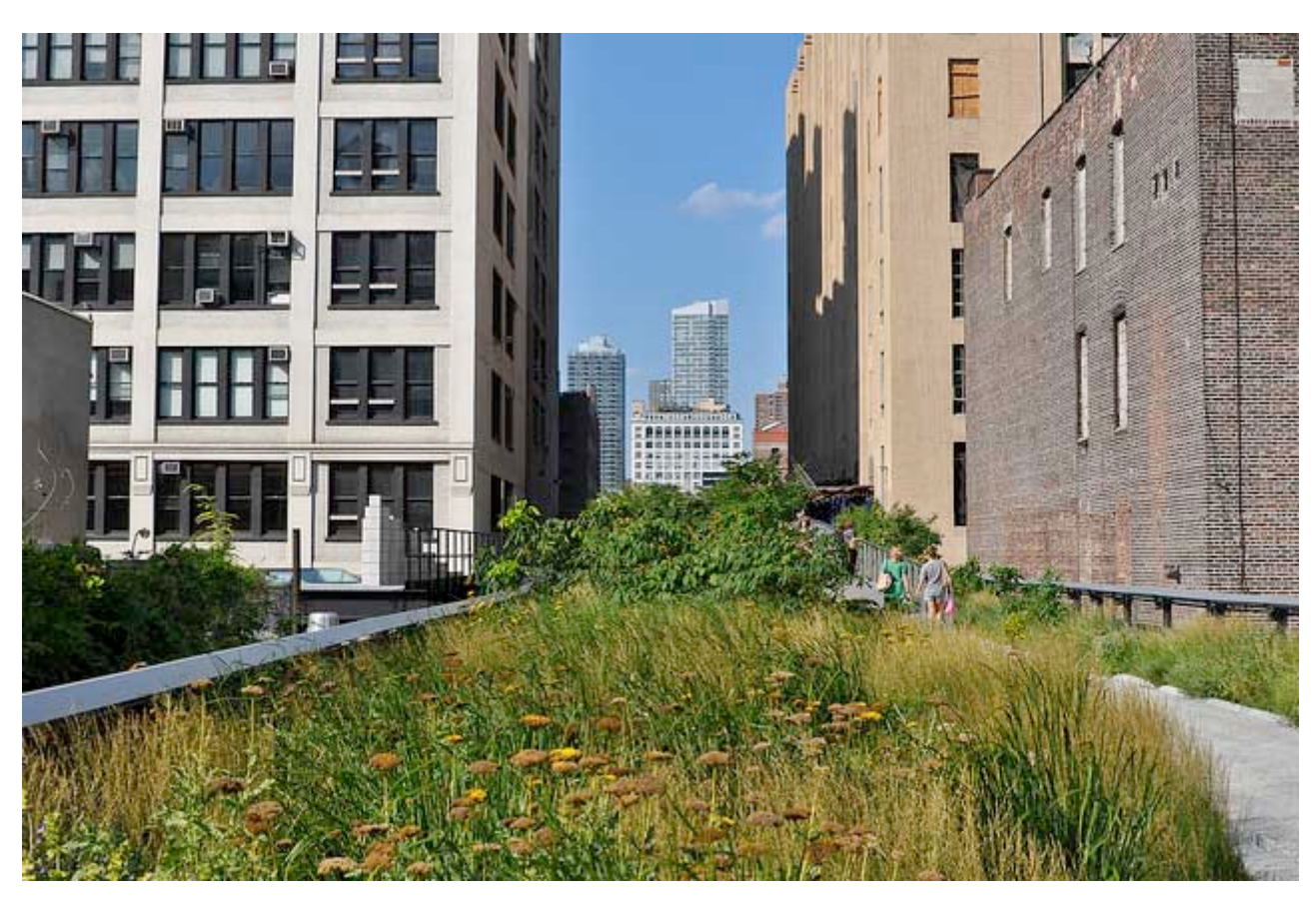
Image: New York City's High Line Park.