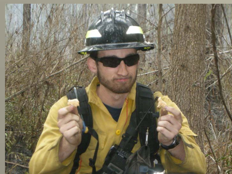
Wildland Fire Planning

Fuels related layers adjusted for known large western wildfires