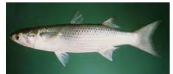
'Ama`ama, Mullet