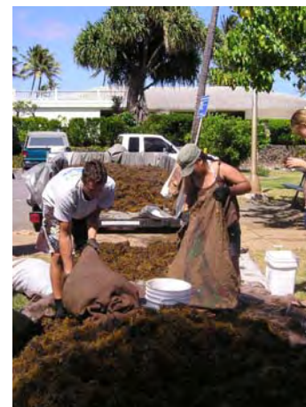
Youth Conservation Corps members remove tons of Gorilla ogo.