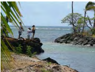
People of all ages enjoy fishing at Maunaloa Bay.