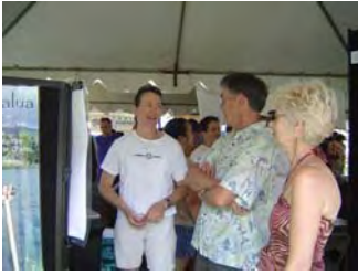
Speaking to Bay residents at public fairs