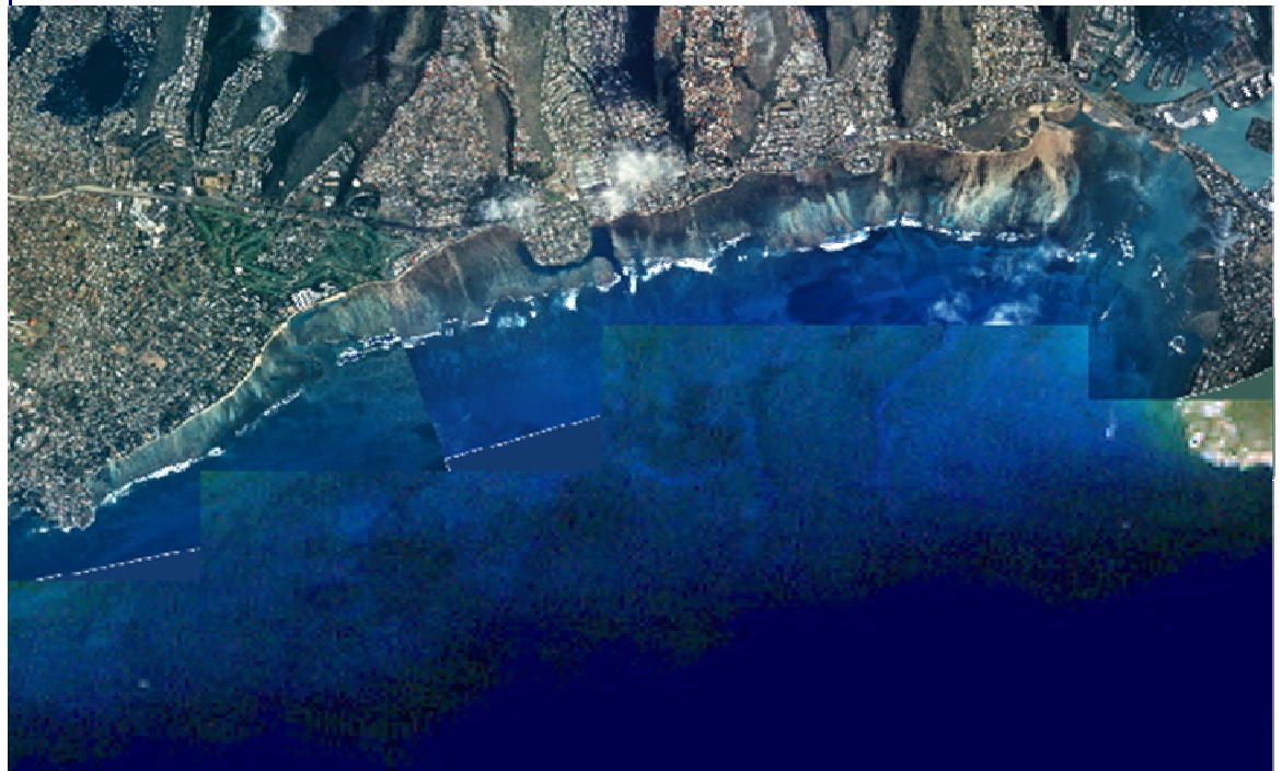
Aerial view of Maunalua Bay from NOAA satellite images