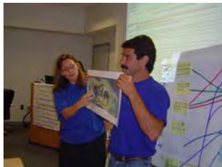
Members from another CAP team explain their situation.