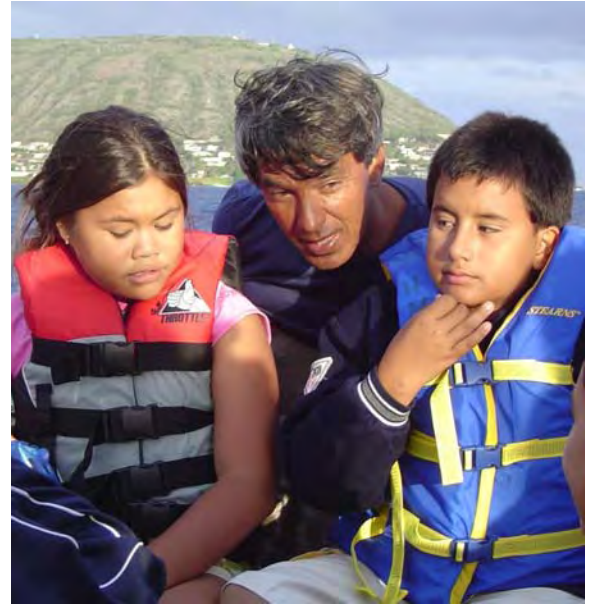
A priority of Mālama Maunalua is involving youth in determining the future of the Bay.

The working groups are presently developing timelines for each Strategic Action and its associated Action Steps. An estimated three-year budget summary is found at Appendix C.