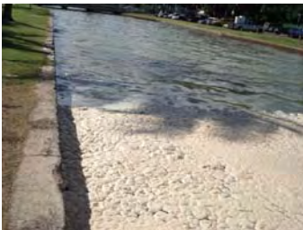
Unknown substance in channelized stream near ocean