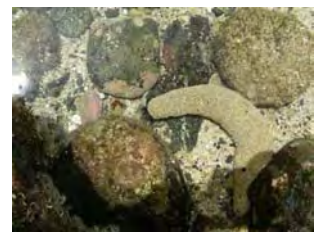
Healthy sea cucumber