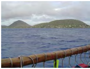
View of Koko Crater and Koko Head from Maunalua Bay

In our efforts to revitalize Maunalua Bay, community partnerships represent our best hope for the future. Partnerships and alliances are voluntary associations of concerned community residents, fishermen, land-owners, government agencies, private and non-profit organizations, teachers and others committed to the common goal of stewardship of the Maunalua Bay region.