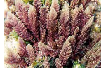
Limu kohu, native Hawaiian algae

Size is a measure of the area of the ecosystem, i.e., its geographic coverage. Minimum dynamic area, or the area needed to ensure survival or reestablishment after a natural disturbance, is another aspect of size.