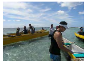
Canoes from Hui Nalu are used to assist with monitoring trips.