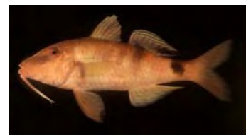
Goatfish, weke