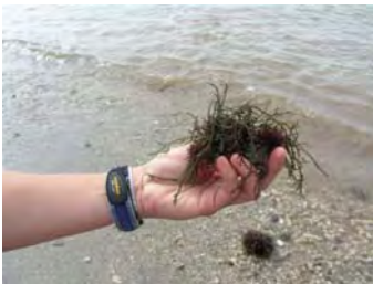
Acanthophora spicifera , invasive marine algae