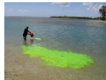
Studying the flow in the Bay using a non-toxic dye