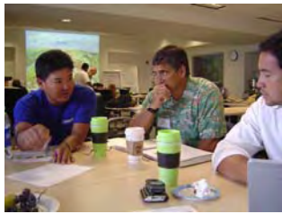
Maunaloa's CAP team discusses various strategies.

This step provides insight on how actions are working, what may need to change, and what to emphasize next. Teams document what was learned to share it with other people who may benefit from the insight.