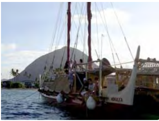
Students board Hōkūleʻa, the Polynesian voyaging canoe, in the Bay