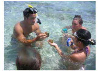
Instructing students on limu identification