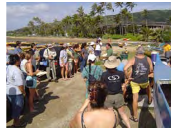
A large community turnout for an educational event

In October 2005, Mālama Maunalua organization was formally launched as a coordinating body for current and future conservation projects at Maunalua Bay. The group consists of residents of the area, fishers, paddlers, teachers, representatives of government agencies and non-profit organizations, facilitators, and others. This group is open to all interested parties who would like to contribute to improving the condition of Maunalua Bay.