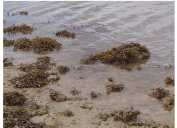
Gracilaria salicornia , Gorilla ogo, an invasive marine algae