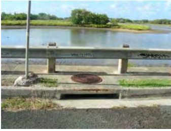
Storm drain next to Maunalua Bay

These high ranking threats have direct impacts to the marine ecosystems of Maunalua Bay. Sediments (mud and soil) smother and kill native plants, as well as corals, clams and other invertebrates in the inshore areas. In a chain reaction, bait-fishes, reef fishes, waterbirds and other animals who feed upon these organisms are thus depleted. Toxic pollutants such as oil, gasoline and pesticides kill the floating larvae of fish, lobster and corals in all areas. Invasive algae disrupt and change the ecological balance of native ecosystems by outcompeting native limu and other organisms for habitat space, and their spread results in fewer fish. They are often also an indicator of other threats to marine ecosystems (high sediment levels, high nutrient levels). Unsustainable harvesting practices in Maunalua Bay have contributed to the severe depletion or disappearance of fish and invertebrate species, particularly in the inshore areas.