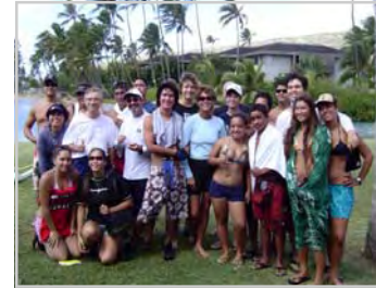
Students from Kaiser High School after a day of studying and cleaning the Bay