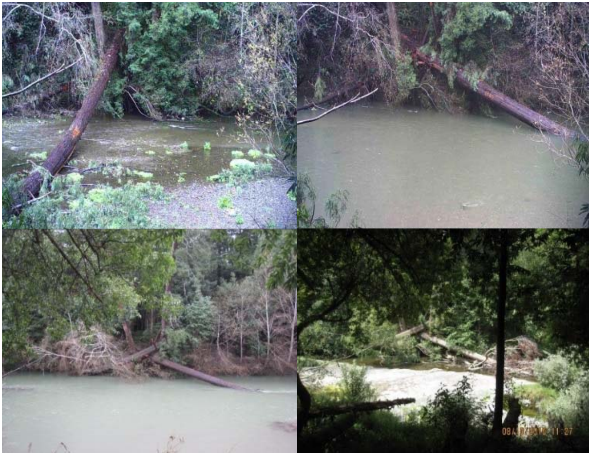
Figure 4. LWM recruitment project in the Gualala River watershed.

Inc. (GRI) 8 successfully retained LWM within the South Fork Gualala River (Figure 4). In this project, GRI directionally felled a large redwood tree between two standing trees. The fallen redwood tree remained despite being shorter than 1.5 times bankfull width and having weathered through several storm discharge events up to 28,500 cubic feet per second (cfs). However, there were two other trees further downstream which were directionally felled as part of this project that were mobilized during moderate-size storm events. Using the AWR method in larger stream channels or rivers should be carefully planned and implemented depending on the identified goals and objectives of the (v)(2) project. Unanchored wood projects in the Gualala River watershed have shown that (1) concentration of wood pieces appears to be more important for pool formation than individual pieces dispersed throughout a reach, and (2) the size of wood relative to channel cross-sectional area appears to be key for effective creation of wood-formed pools (Church 2012).