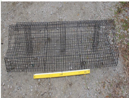
Modified crab trap

Output: Experimental results, combined with previous monitoring efforts, will yield a final synthesis to determine the relative success for each of the different sites and strategies. The tangible result of this project will be a guidance document for SC DHEC and others implementing living shorelines that describes options for living shorelines and the environmental and physical conditions under which they are each successful.