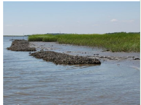
Oyster bags (SCORE)