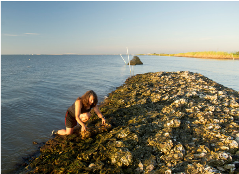
Oyster reef restoration in Mobile Bay, AL, as part of the Restore Coastal Alabama project.

In the coming year, the app is being expanded to include all of South Florida as well as New Jersey, North Carolina, Virginia, the Caribbean, and other sites in the Gulf of Mexico. The development