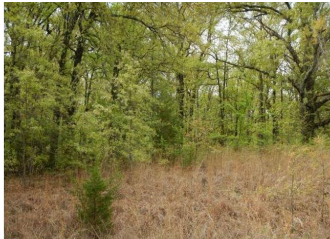
Typical woodland area where mechanical thinning would be applied

LF products provide regional (outside of Texas military boundaries) information to see if conditions outside the sites affect the ecosystems. We use that information to plan and implement management for invasive species, changes in ecosystems, and possible erosion issues that could affect training sites now and in the future. For example, because erodible land within several miles could someday cause problems on military sites, we manage for more grass undercover to slow possible erosion.