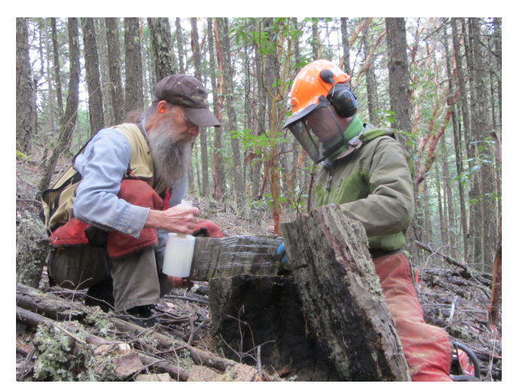
Preparing a fire-scar sample for collection from an old stump.

Paul Hessburg Research Ecologist USFS Pacific Northwest Research Station