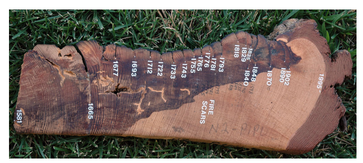
Cross-dated fire-scars on a section of ponderosa pine.

This research shows how fire exclusion has narrowed the role of fire to one dominated by large fires during the hottest times of the year when fires are more likely to be higher severity, and suppression is the most difficult, dangerous, and costly. This makes a case for using fire in cooler spring and fall months, along with significant fuels reduction work, to prepare our forests for a changing climate.