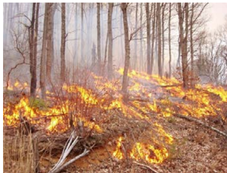
Controlled burn at Osborne Ridge Knob, in the Central Escarpment FLN landscape.

Nearly every conversation seemed to develop around the same theme: building community support for fire in the southern Appalachians. Although many of these mountain ecosystems evolved with regular fire, controlled burning is not as widely accepted in the uplands as it is in North Carolina's more coastal communities. Following the 2016 wildfires, FLN partners have been pushing harder than ever to get good fire on the ground and reduce wildfire risk. Some communities, like Creston, represented at the meeting by local "spark plug" Dinese Drake, are jumping on board to become better fire adapted. McDowell County Ranger Chris Davis, with the state Forest Service, said that since the wildfires, they receive many more calls from people concerned about smoke and wildfire. On the other hand, some communities are still resistant.