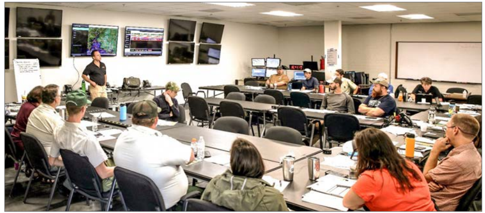
Twenty-three partners from the Central Escarpment landscape met at McDowell Technical Community College in Marion, North Carolina. This 425,000-acre landscape is part of the regional Southern Blue Ridge Fire Learning Network.