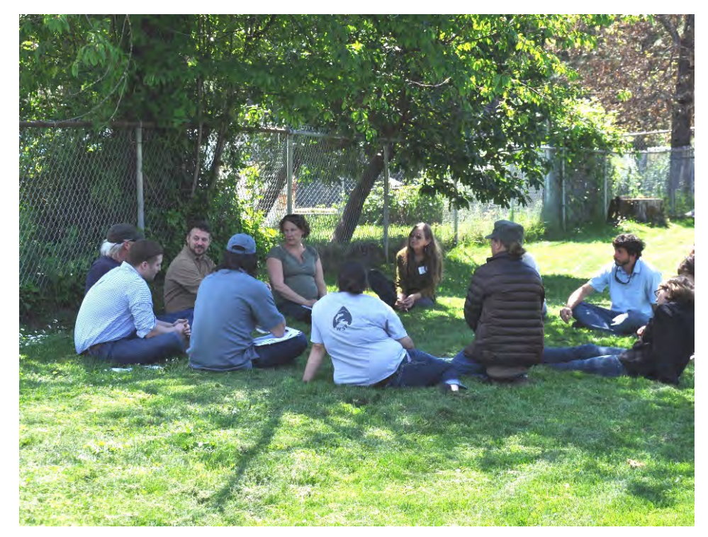
Among the breakout sessions was one on the topic "Research: What are our burning questions?"