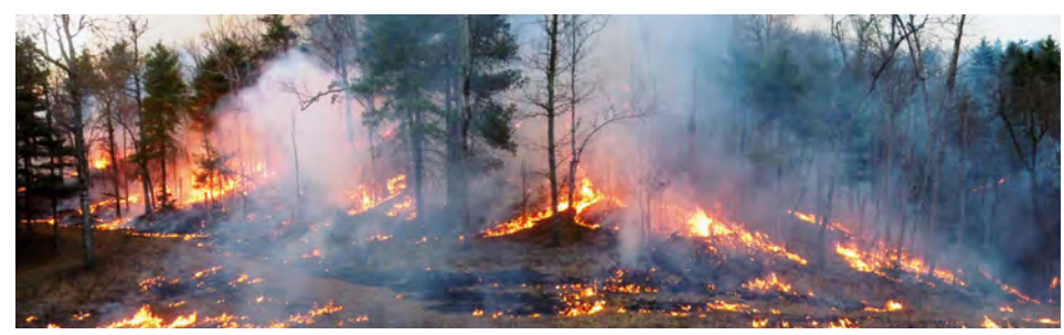
Ryan Jacobs/NC WRC

More about the landscape: http://www.nature.org/ourinitiatives/regions/northamerica/unitedstates/northcarolina/placesweprotect/south-mountains-game-land.xml