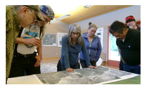
Then and now: participants in the January 2016 IPBN workshop compare aerial photos from the 1940s and contemporary satellite imagery.

The second workshop this spring was the first of what will be two sessions in developing a Healthy Country Plan. This planning is patterned after similar efforts by aboriginal people in Australia and was brought to the attention of this group by Fire Learning Network (FLN) staff and The Nature Conservancy's Global Fire Director, who facilitated this workshop. One of the goals identified at this workshop was to increase the number of families involved in family-led burning to 40 families, distributed