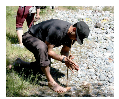
The Director of the Warrior Institute demonstrates the use of a fire drill during Spring Camp.

Among the goals in this landscape is the development of a pathway for longterm restoration of traditional fire culture. The life stages diagram moves the group in that direction, describing in detail the lifelong training process required to develop a traditional fire practitioner, including what types of learning and practice need to happen in different life stages. Workshop participants have identified various programs in their communities—for example, the Warrior Institute in Hoopa —that they could use to accomplish training and practice at each level, and they are fitting them into this framework.