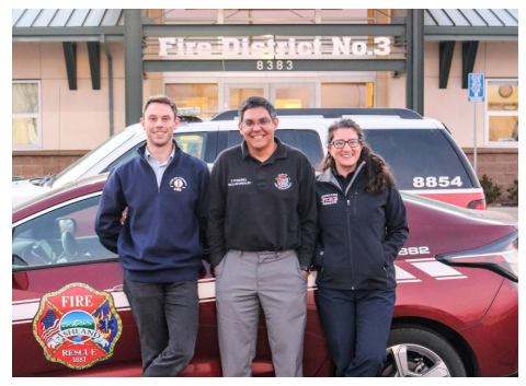
In December, FAC Net members from municipal fire services met for a learning exchange about FAC Coordinator roles.

members were contacted by a number of reporters, and they took advantage of the opportunity to offer examples of a better way forward. The work of FAC Net and our members was featured in more than 15 magazines, newspapers and radio stations, including the Christian Science Monitor , New York Times , Washington Post , Yes! and Fortune .