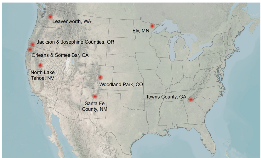
FAC Learning Network pilot communities

Scaling-up to Promote Ecosystem Resiliency funding is allowing six landscapes to apply treatments that tie together work done on, or planned for, federal lands. Strategically placed treatments thus impact a large scale, for example completing work that protects a community's watershed. Others leverage landscape-scale restoration of priority forest types, building system resiliency. Relationships and planning developed through long-term work together in FLN landscapes set the stage for most of these projects.