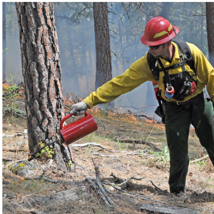
SPER project in Ashland (OR) watershed

Key to the success of the training is the integration of professional wildland firefighters into a diverse group of participants. Basic NWCG courses were offered to 15 students to provide the certification needed to allow this. Involving numerous less-traditional practitioners in the prescribed fire training expands the capacity of the fire community, as well its ability to conduct fires effectively and with full social license. The range of partners served includes university students, biologists, ranchers and farmers, municipal firefighters, volunteer fire departments, sheriff's deputies, conservationists and private fire contractors as well as managers and practitioners from county, state and federal land management agencies.