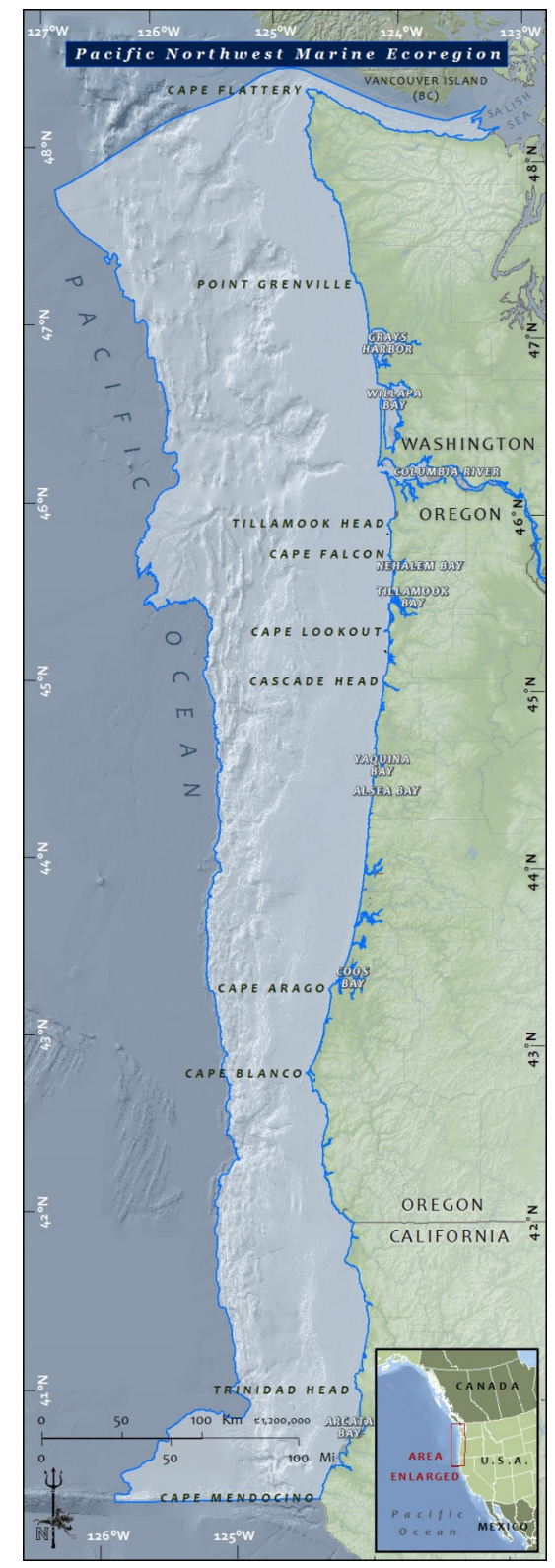
Figure 1. Map of PNW Marine Ecoregion

The results of this assessment will be available to all parties that are engaged in marine resource planning in the Pacific Northwest Marine Ecoregion. The Nature Conservancy will use the assessment results to prioritize conservation projects and funding allocations for this and neighboring ecoregions. Governments, land trusts, and others are encouraged to use the results of this assessment to guide conservation strategies within the ecoregion.