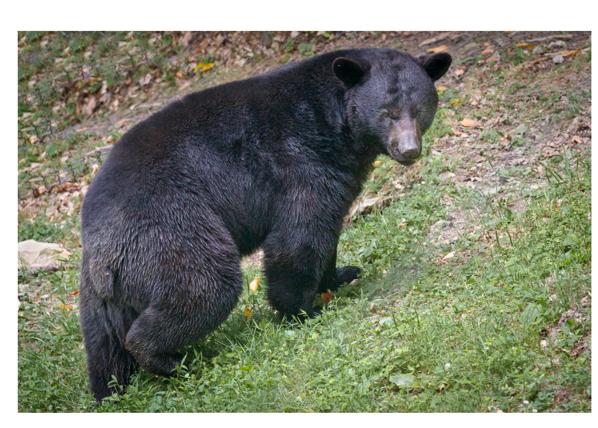
RESTORING THEIR HOME

Forest Service mountain staff participated in a TREX interagency fire training sponsored by the Southern Blue Ridge FLN.