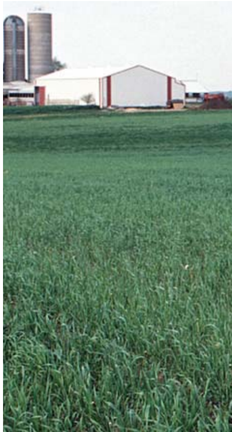
Cover crops on a field in Black Hawk County, Iowa.