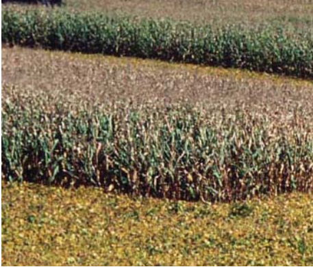
Stripcropping with Cover Crops, Lancaster County, PA.