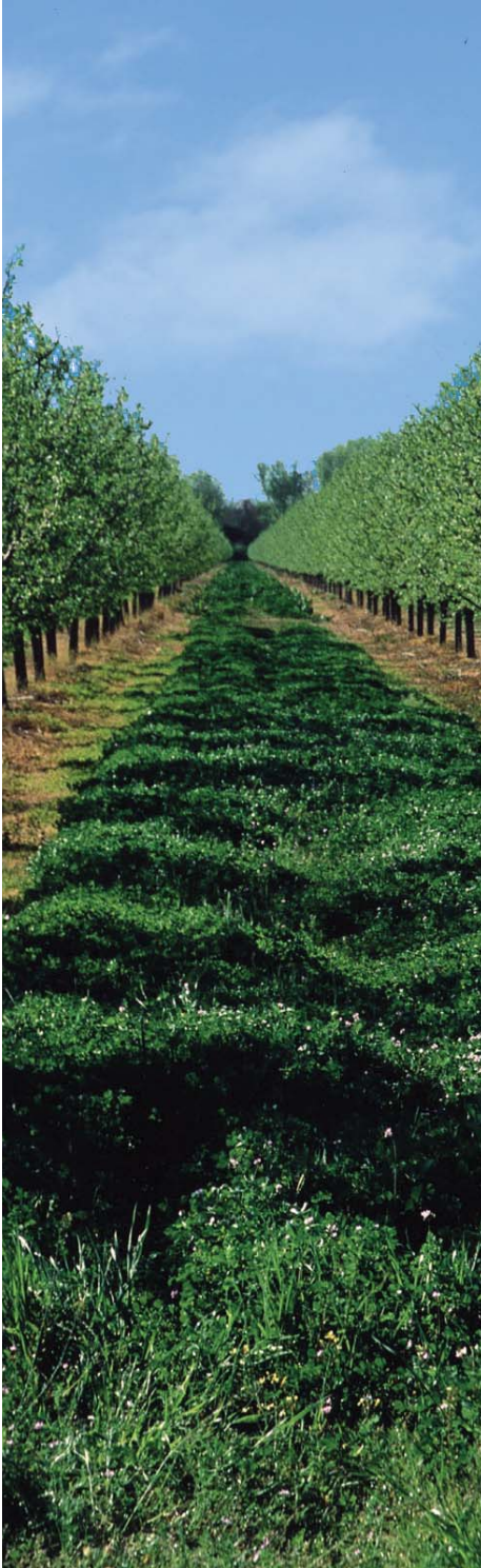
Cover crops in an orchard reduce soil erosion.