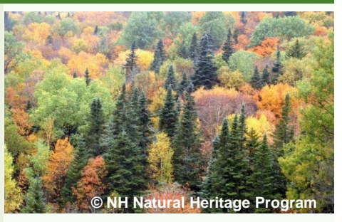
Northern Hardwood Forest

The 732,000 major roads that crisscross our region divide our forests into blocks. Oak-Pine forests have more roads and fewer large blocks than any other forest type. Small blocks of forest have less of the quiet, sheltered, and secluded forest interior habitat preferred by many forest dwelling species. Instead, each block has increased edge: exposed, noisy, and weedy regions that track the boundaries of major roads.