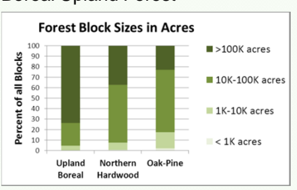
Proportion of Large Forest Blocks

Underlying data developed by The Nature Conservancy's Eastern Science Office with support from the Northeast Association of Fish and Wildlife Agencies.