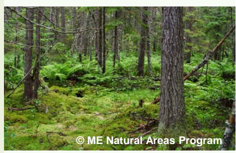
Boreal Upland Forest