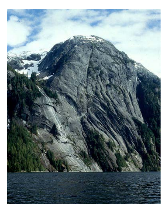
FIG 2. View of a steep-walled, rocky fiord in North Misty Fiords. This province has rugged topography and a limited abundance of productive forest land.

North Misty Fiords Province occurs along the southern mainland and splits Misty Fiords National Monument and Wilderness nearly in half with the northern part slightly larger (Fig 1). North Misty Fiords is dominated by steep-walled granitic fiords and narrow valleys with highly fragmented stringers of conifer forest. It has the lowest percentage of productive old growth (POG)—17%—of any province except the four northernmost mainland provinces. Ninety percent of the province is designated National Monument/Wilderness, and is typical of these wilderness reserves in having very high scenic and very low timber values.