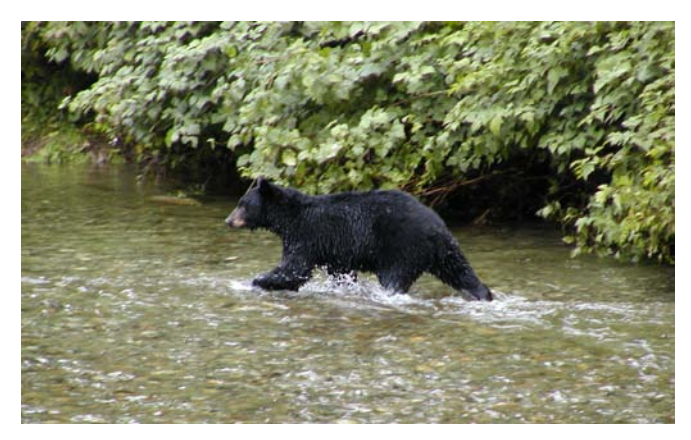
FIG 3. Both black and brown bears may be seen from the Fish Creek viewing area, near Hyder.

A stock of very large chum salmon occurs in Fish Creek, near Hyder. Average size of these fish is nearly 20 lbs (9 kg), about twice that of normal chums. These fish spend longer at sea than other populations. The bear-viewing facility on this creek is one of the few places in Southeast where visitors can drive to an observatory from which both black and brown bears can be seen (Figs 3, 4).