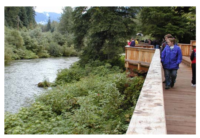
FIG 4. Bear-viewing on Fish Creek.

brown bears occur throughout mainland watersheds. This conservation assessment ranked the bear habitat values of the Unuk and Chickamin among the top 12 watersheds in Southeast. Brown bear populations are generally much lower on the mainland than the ABCs (Admiralty, Baranof and Chichagof Islands). ADF&G statistics on brown bear kills by sport hunters between