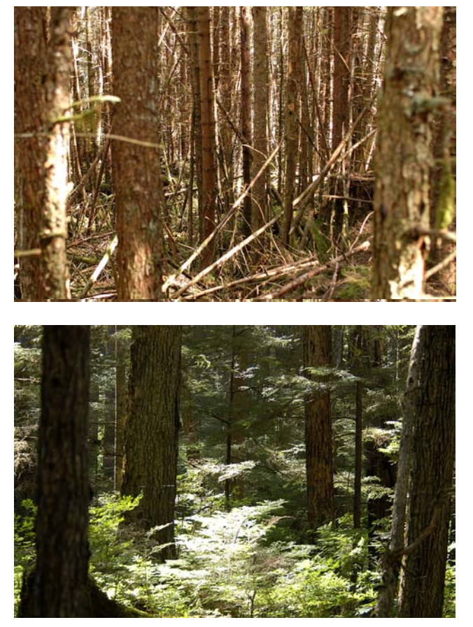
FIG 7. Contrasting habitats of second growth (top) with old growth. Old growth provides significantly more deer forage than second growth. As more area becomes dominated by second growth, deer populations are expected to decline reducing carrying capacity for wolves.

Timber harvest on Prince of Wales and adjacent islands is predicted to reduce the carrying capacity for deer by 8% during the next 50 years, which would be as much as 36% less than the level prior to 1955 when