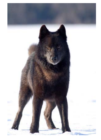
FIG 2. A black wolf near Juneau. Southeast wolves are generally smaller and darker than interior Alaska wolves.