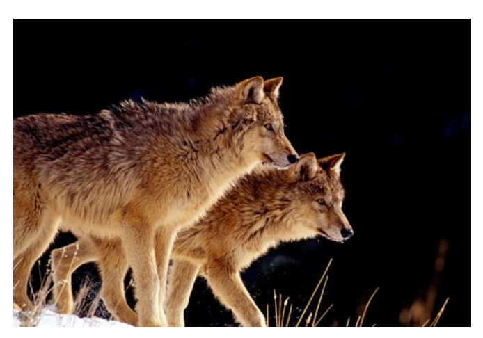
FIG 1. Two gray wolves hunting along the Alsek River on the Southeast mainland north of Glacier Bay.

Wolves are highly social, generally occur in packs, and defend territories from other packs. In most of Alaska, wolf packs depend on large ungulate populations—primarily moose (Alces alces) and caribou (Rangifer tarrandus)—as their major food resource. Wolves are endemic to Southeastern Alaska (Southeast), where they largely overlap their primary prey-the Sitka black-tailed deer (Odocoileus hemionus sitkensis ) on the islands and southern mainland, as well as moose and mountain goats (Oreamnos americanus) along much of the mainland coast. The Alexander Archipelago wolf (Fig 2), the subspecies occurring in Southeast, is smaller and darker than other wolf populations in Alaska (Wood 1990, Goldman 1944) and more restricted in distribution. As a result of the isolated and naturally fragmented geography of Southeast, the Alexander Archipelago wolf is potentially more sensitive to human activity and habitat disturbance than elsewhere in the state. This greater sensitivity is particularly a concern in the southern archipelago where deer