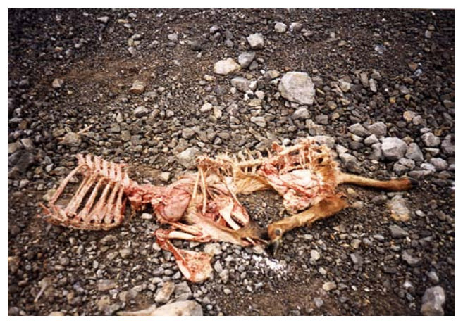
FIG 4. Deer carcass killed by wolves on Heceta Is. in southern Southeast. Deer are the primary prey of wolves on the southern islands while moose and mountain goats are also major prey taken on the mainland coast. (Dave Person)

Throughout much of Southeast, particularly on the southern islands and portions of the mainland, deer are the primary prey of the wolf and represent the largest component (up to 77%) of its diet (Smith et al. 1987, Kohira 1995, Person et al. 1996) (Fig 4). Person et al. (1996) estimated that the annual predation rate was approximately 26 deer per wolf. Other important food items consumed by deer include beaver ( Castor canadensis ), moose, mountain goats, and spawning salmon ( Onchoryncus spp. ) (Smith et al. 1986, Wood 1990, Kohira 1995). Pack size on the southern islands ranged from 2–16 wolves per pack, and home range size was correlated with pack size, which is positively