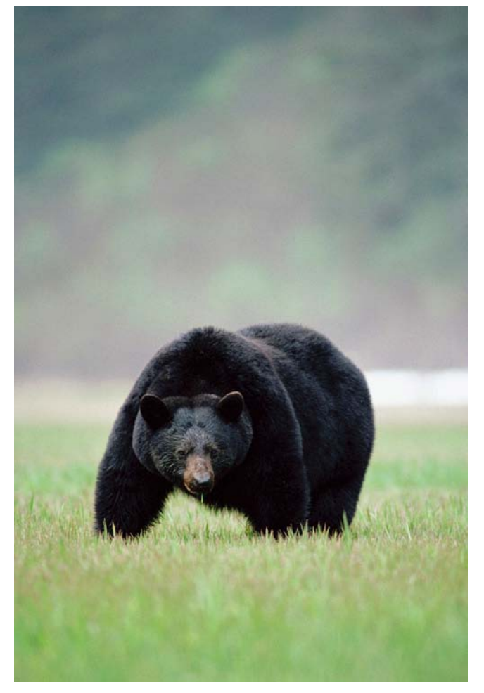
FIG 1. An adult black bear in spring feeding on a tidal sedge flat in southeastern Alaska. (John Hyde)

The black bear (Fig. 1), which occurs in northern Mexico, 32 states, and much of Canada, is the most abundant and widely distributed of the three bear species in North America. The distribution of this