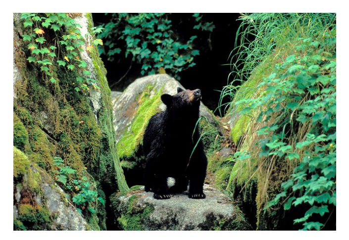
FIG 10. A black bear walking through a riparian area adjacent to a Southeast salmon stream. Riparian habitats are important to bears during summer and fall when they feed on spawning salmon, berries, and sedges. (John Hyde)

Conservation of black bears in Southeast will require a comprehensive assessment of bear habitat relationships and a better understanding of the effects of forestry and roads on bear populations. Little habitat research has been conducted on black bears in Southeast, and this lack of information must be corrected. Black bear conservation will be enhanced by the protection of key habitats, including important feeding and denning habitats, and management of mortality rates within sustainable levels. Maintaining the productivity of Pacific salmon stocks throughout Southeast is an essential component for conserving productive bear populations (Fig. 10). To ensure that black bear populations are well represented throughout their natural range in Southeast and available for human use and enjoyment, watersheds with a variety of high-value habitat should be identified and protected at the watershed scale within each biogeographic province that supports productive bear populations (Fig. 11).