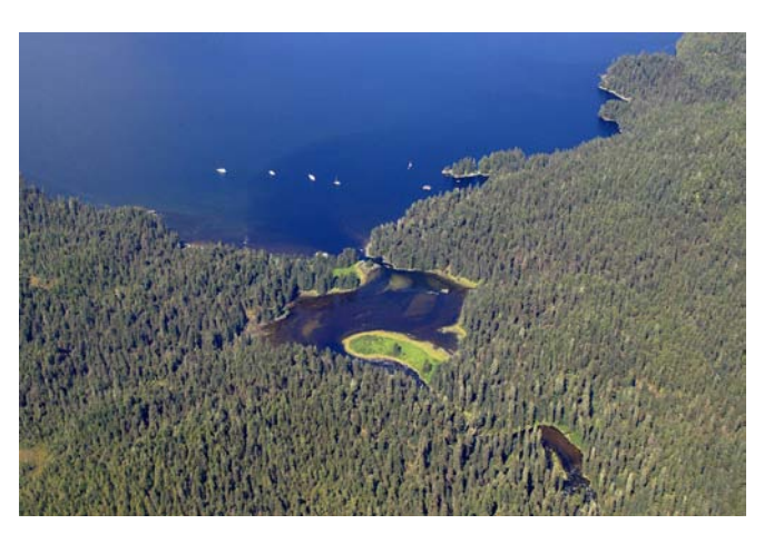
FIG 4. Aerial view of the mouth of Annan Creek on the northern base of the Cleveland Peninsula south of Wrangell. Annan Creek Wildlife Viewing Area—managed by the Forest Service—is one of the best areas in the state to view black bears. Both brown and black bears occur in this mainland watershed.

Bear viewing has been growing in popularity throughout Alaska. In Southeast, three recognized areas have excellent opportunities for black bear viewing. Annan Creek Wildlife Viewing area, located in the Tongass National Forest on the mainland halfway between Wrangell and Ketchikan, is the best known and most established area (Fig. 4). A U.S.