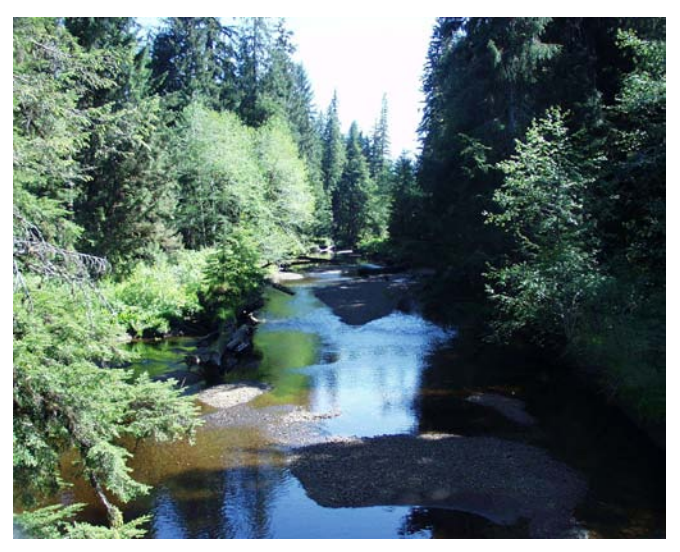
FIG 5. Kadake Creek on northern Kuiu Is. is used extensively by black bears for fishing on spawning salmon during late summer. Smaller, more fishable streams, appear to be preferred by black bears and many different bears use these streams for short periods of time. (Lily Peacock)

Most black bears in Southeast probably emerge from winter dens during April and May. Presumably like brown bears, males leave their winter dens before females, particularly females with spring cubs. Following den emergence, many black bears are observed foraging on tidal sedge flats and south-facing avalanche slopes for newly emergent sedges and other vegetation. Erickson et al. (1982) observed bears feeding on green vegetation in south-facing clearcuts (<25 yr) on Mitkof Island.