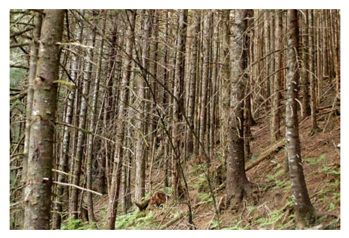
FIG 8. An even-aged second growth forest 60 years old has low value as foraging habitat for bears. (John Schoen)

Harris (1974), Harris and Farr (1974, 1979), Wallmo and Schoen (1980), and Alaback (1982). In general, after logging, herbs, ferns, and shrubs grow abundantly for several years and peak at about 15 to 20 years. At about 20 to 30 years, young conifers begin to overtop shrubs and dominate the second-growth stand. After 35 years, conifers completely dominate second growth, the forest floor is continually shaded, and forbs, shrubs, and lichens largely disappear from second-growth stands (Fig. 8). The absence of vascular plants under second growth generally persists for more than a century following canopy closure (30-130 yr). Consequently, clearcutting old growth and managing second growth on 100- to 120-year rotations significantly reduces foraging habitat for most wildlife species for 70-80% of the timber rotation (Harris 1974, Wallmo and Schoen 1980, Alaback 1982). Although riparian large-tree old growth represents a small proportion of the land area in Southeast, these stands have been disproportionately harvested throughout the region (USFS 2003).