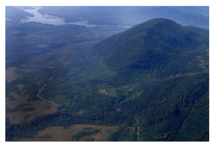
FIG 9. Aerial view of east central Mitkof Island south of Petersburg showing a forest mosaic of muskeg bogs, old growth, second growth, and clearcuts with an interconnected road system. Roads enhance human access and the probability of increased human-bear interactions which can result in elevated mortality pressures on bears. (John Schoen)

In Southeast, black bears are likely most concentrated during late summer in riparian forest habitat associated with anadromous spawning streams (Peacock, personal communication 2005). Maintaining important riparian habitat and abundant salmon runs is considered essential for maintaining productive brown bear populations in Southeast (Schoen et al. 1994, Titus and Beier 1999) and is likely also important for black bears. The maintenance of riparian buffers along anadromous salmon streams is also vitally important for sustaining productive salmon runs (USFS 1995). Although riparian forests make up only a small portion of the land base of Southeast, they have been disproportionately logged (Shephard et al. 1999, USFS 2003).