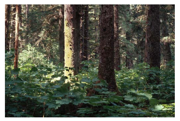
FIG 7. Large-tree riparian spruce forest in Southeast. Such stands are used by bears for feeding and resting habitat. A variety of berries occur in these stands, including devil's club berries, salmon berries, and currants.

The majority of the forested land in Southeast occurs in the Tongass National Forest, which makes up 80% of the Southeast land base (USFS 2003). About two-thirds of the Tongass Forest is forested, although productive old growth encompasses only 5 million acres (2 million hectares), or about 30% of the land area of the Tongass (USFS 2003). The majority of productive old growth on state and private lands has already been harvested during the last 40 years (USFS 2003). Old-growth forests are diverse and highly variable in structure. In the most productive stands of old growth, individual trees may be 4-8 ft (1.2-2.4 m) in diameter and more than 200 ft (61 m) in height. These large-tree stands are rare in Southeast, representing only 3% of the Tongass land base (USFS 2003). Stands of riparian spruce forests with very large trees (Fig. 7), largely confined to valley bottom flood plains, are rare, representing less than 1% of the Tongass land base (USFS 2003). For details about the ecological structure and composition of old growth, see Chapter 5.