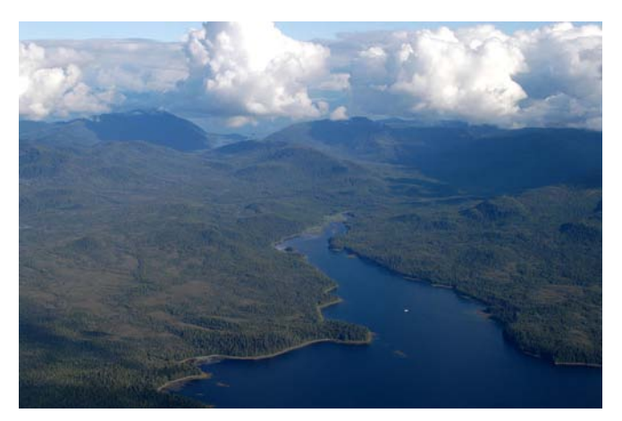
FIG 11. Vixen Inlet on the Cleveland Peninsula north of Ketchikan is one of the highest value bear habitats in the Revilla-Cleveland Province. Intact watersheds with a variety of habitats and productive salmon streams provide important habitat for bears. (John Schoen)