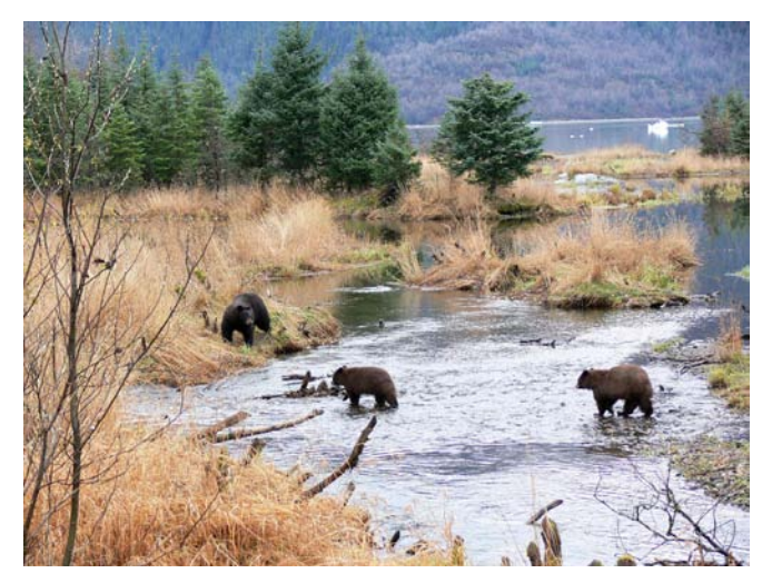
FIG 6. A black bear female and 2 cubs walking a salmon stream in the fall searching for fish. (Bob Armstrong)

During summer and fall, black bears also consume abundant berries when available, including salmonberries ( Rubus spectabilis ), blueberries ( Vaccinium sp. ), currants ( Ribes spp. ), and devil's club