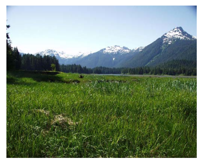
FIG 3. Security Bay on Northern Kuiu Is. in central Southeast. This watershed was part of the Northern Kuiu Is. study area in Peacock's black bear investigation which documented one of the highest density black bear populations in North America.

Alaska were 0.7 and 0.4 bear per mi<sup>2</sup> (0.27 and 0.17 bear per km<sup>2</sup>), respectively (Schwartz and Franzmann 1991, Miller et al. 1997).