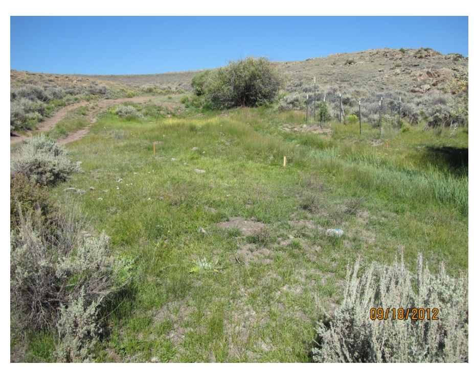
September 10, 2012