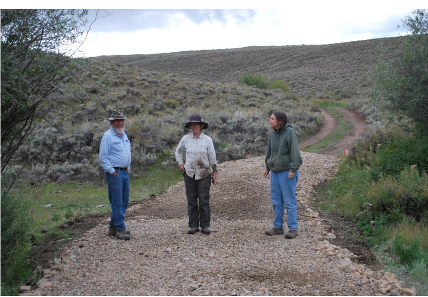
Completed low water crossing at West Fork, Wolf Creek on BLM lands