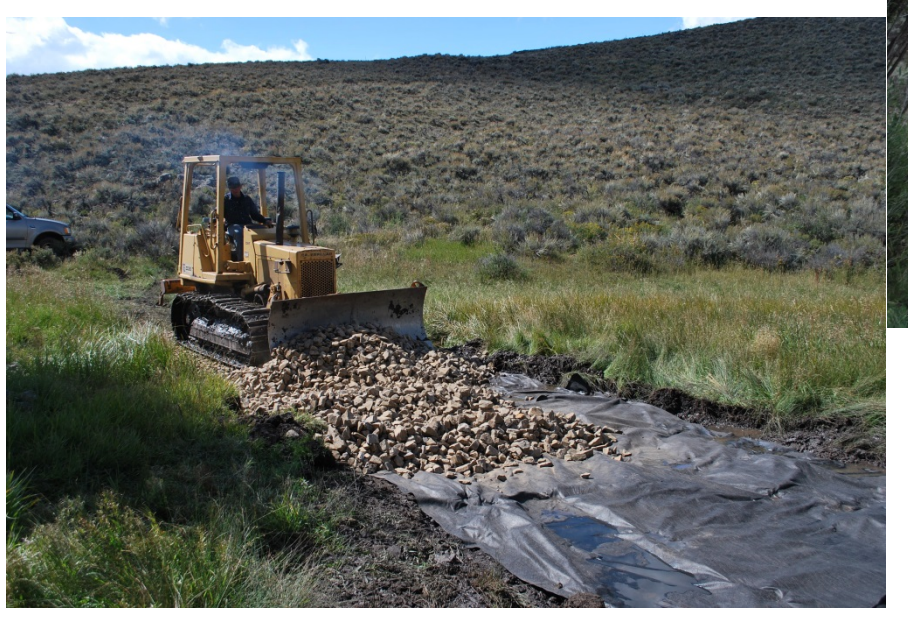
Building low water crossing on Wolf Creek Ranch