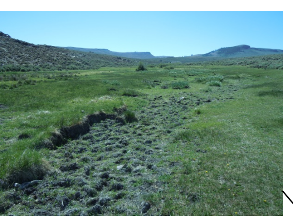
Moncrief Ranch in Kezar Basin