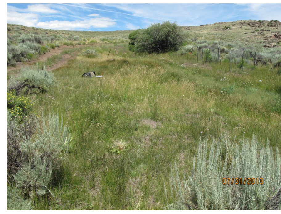
July 31, 2013