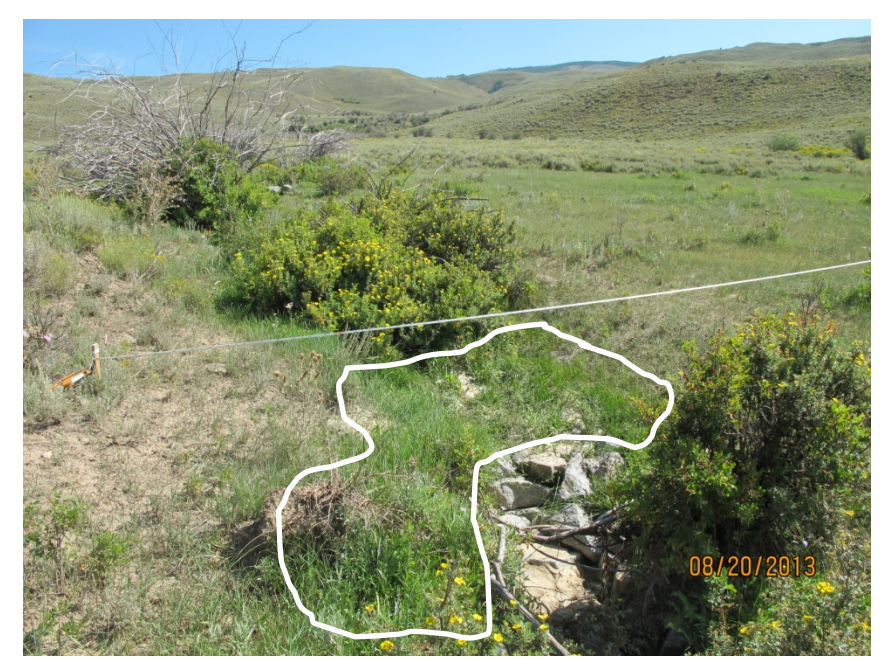
Bare ground and litter occupied 6% in 2013

The white polygon represents the area that will be impacted by the one rock dam