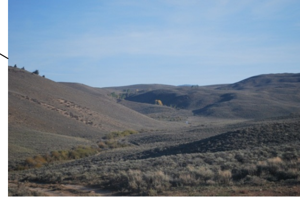
Redden Ranch West Flat Top