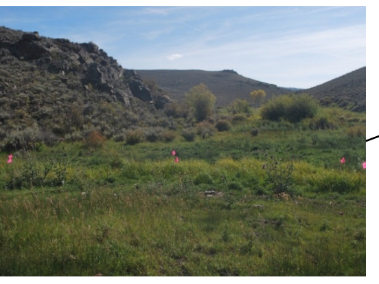
Wolf Creek (both private ranch & BLM lands)