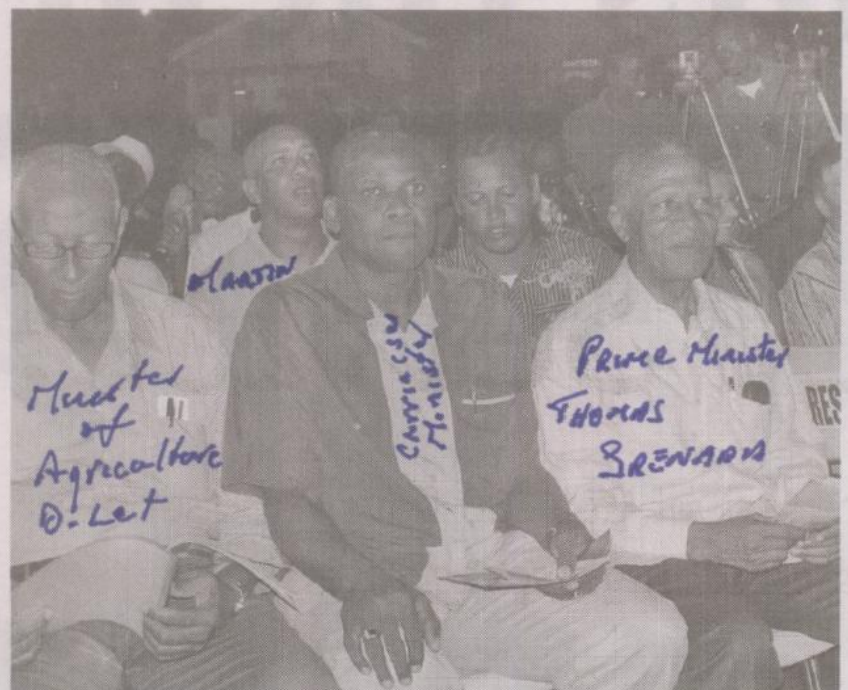
Prime Minister Tillman Thomas (centre) who made the announcement about the infrastructural development in Carriacou among other Cabinet Ministers

One of the projects ready taking place the construction of he Top Hill/Belair