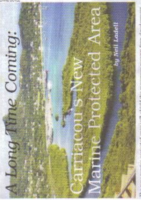
The new marbue protected area will shield the neargrove swamp from development but still allow its use as a hurrhome hole.