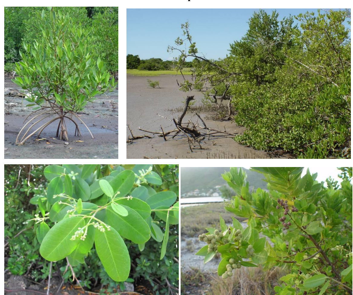
Fig 2. Clockwise from top left, Rhizophora mangle, Avicennia germinans, Conocarpus erectus, and Laguncularia racemosa.