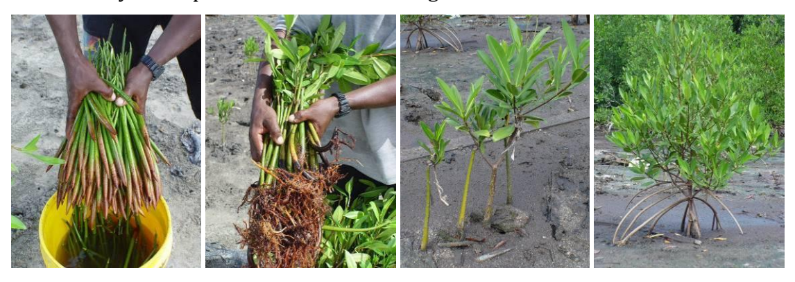
Fig 5. From left to right, mature propagules, rooted propagules, one-year seedlings, and three-year shrubs.

Seeding red mangroves in restoration sites is relatively simple. Many people have had success merely collecting seeds from trees and sticking them in the soil directly. While this can work, the odds are significantly increased if seeds are first pre-rooted prior to planting. Once seeds are collected, they will be brought to a central location [Margaret's House] and placed in white 5-10 gallon plastic buckets half filled with seawater in the shade. Buckets should contain no more than 40-50 propagules, so that they don't get too crowded. The seawater must be changed every 2-3 days to prevent fouling and death for seeds, thus staging this process near easy access to seawater in a must. Over a period 2-3 weeks, fine roots will develop at the bottom tip of the seeds. You will find that some do not develop roots, and others may simply brown and die all together. That's exactly why we do this preparation, to find the strongest, healthiest, most successful seeds for out restoration effort. These viable, pre-rooted seeds are now ready for careful planting and will be significantly more successful than planting un-rooted seeds directly because they can immediately take up nutrients and water to grow and establish.