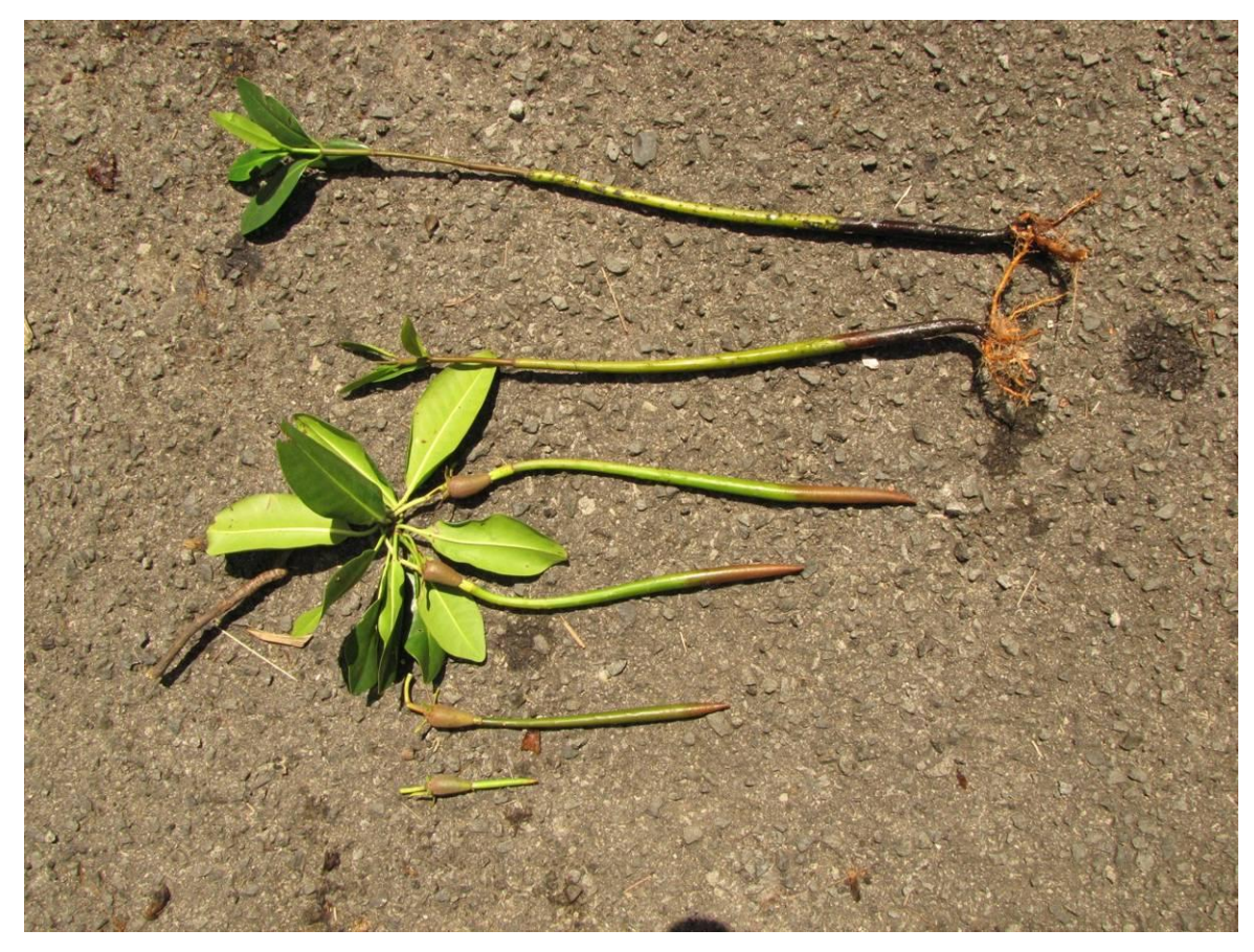
Fig 4. Stages of development for the red mangrove, from germinating seed (bottom) to rooted seedling (top).

Mangrove seeds are technically called "propagules" because unlike most other plants' seeds, mangrove propagules germinate while still on the tree! This is an adaptation that helps then to grow rapidly upon falling to the soil below once they are ripe. However, for convenience, we will refer to them as seeds in this document.