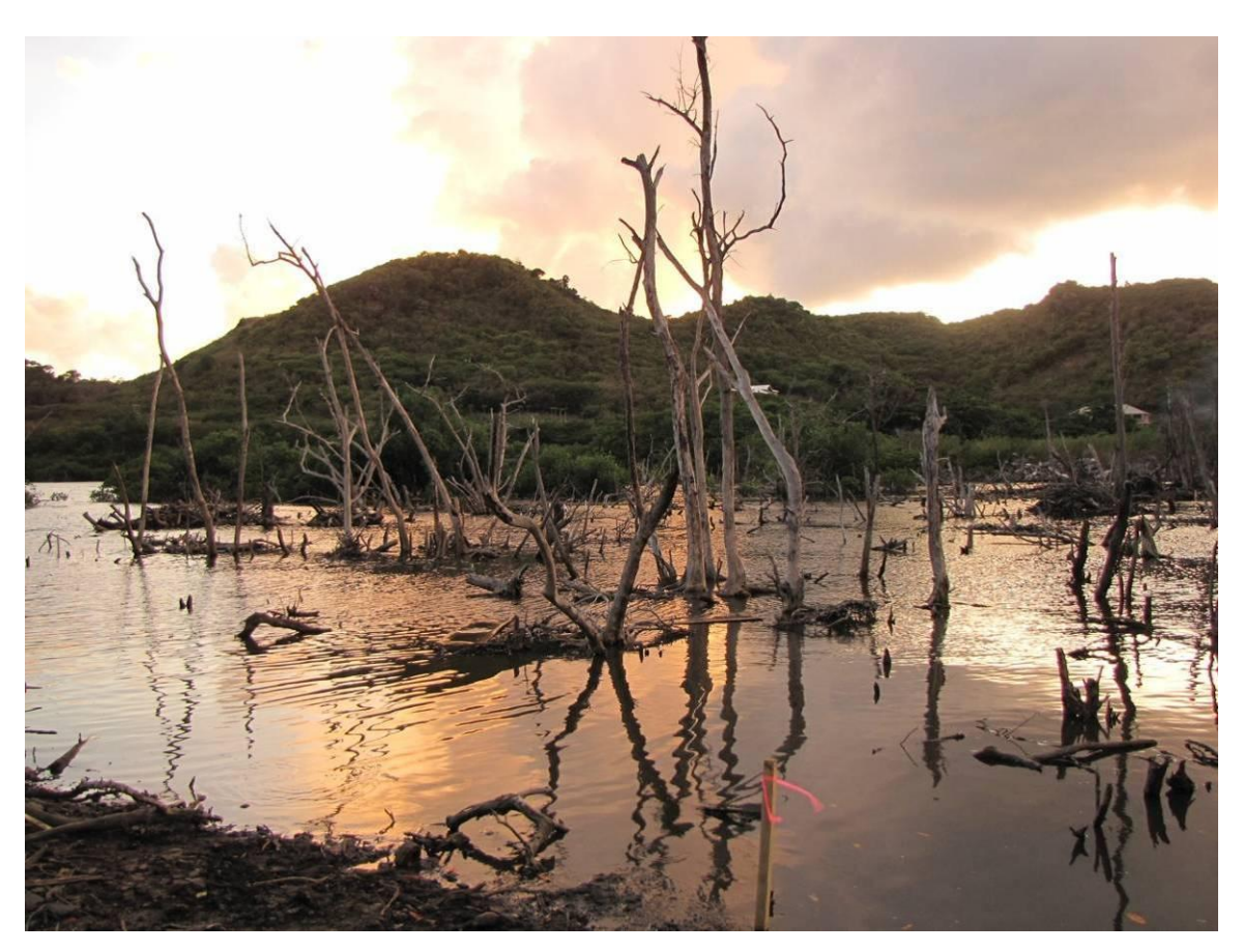
Fig 1. Sunset at the Woburn Bay Marine Protected Area in October 2009, prior to community-based restoration efforts.

This community-based restoration project seeks to engage local NGO's, community groups, and government in the evaluation, design, implementation, monitoring and stewardship of a community-based mangrove restoration and management opportunity located within or directly adjacent to a Marine Protected Area (Woburn MPA). The successful project will result in 1) increased local appreciation and stewardship of mangrove ecosystems, 2) creation of immediate livelihood opportunities associated with the restoration and management of the mangrove, and of course 3) a reforested and ecologically functional mangrove habitat at the project site.