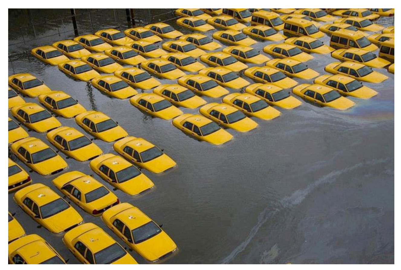
Image: Taxi terminal, Hoboken, NJ, flooded after Hurricane Sandy.

By Jon Fisher, spatial data analyst, Central Science, The Nature Conservancy