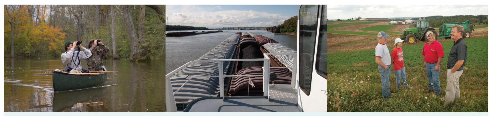
Outdoor recreational activities within the Mississippi River Basin contribute billions of dollars annually to the nation's economy. • The Mississippi River system is the most active waterway system in the U.S. for freight transport. • Agricultural products from the Mississippi River Basin are worth $54 billion annually.