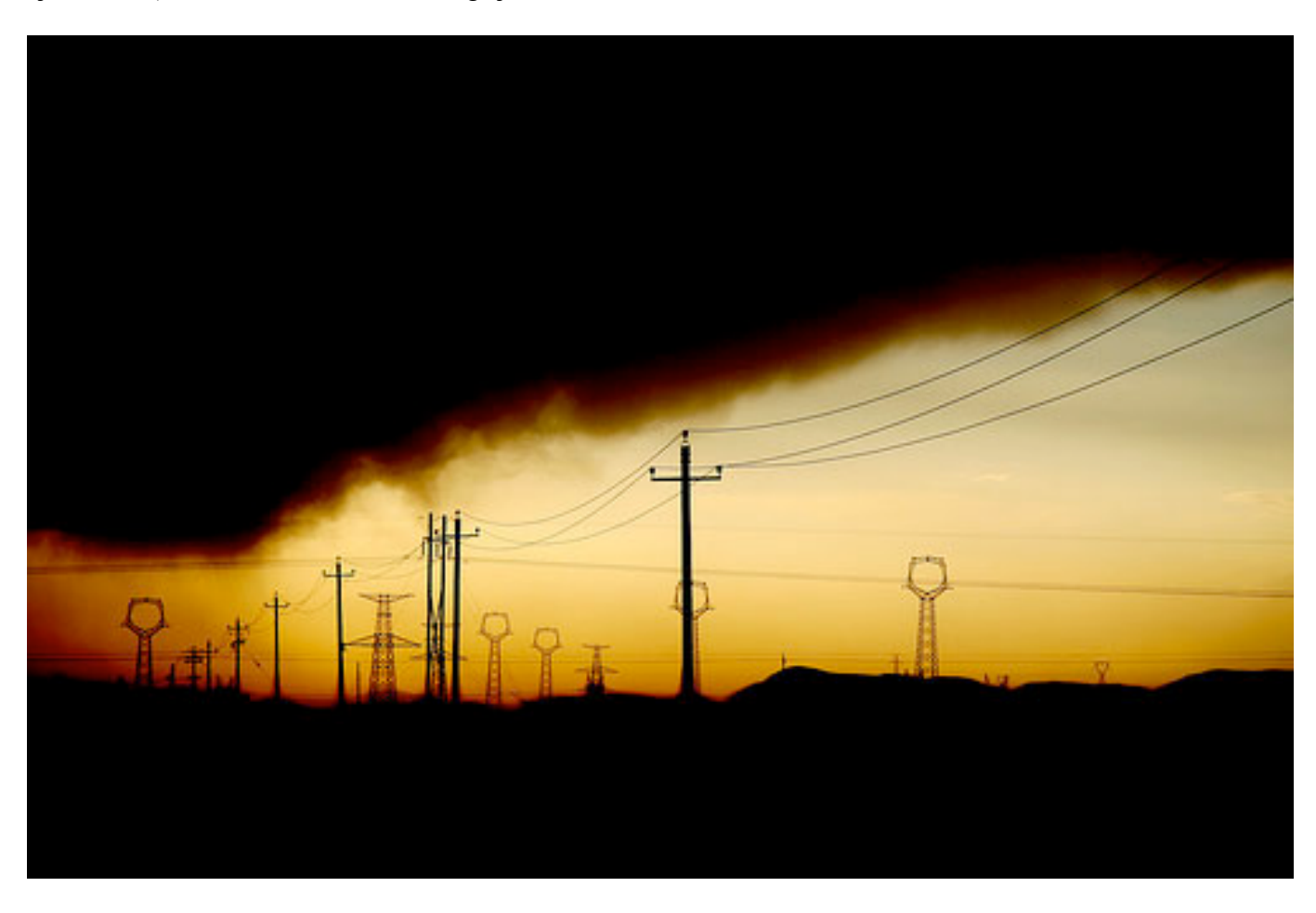
Image: Air pollution and power lines outside Beijing, China.