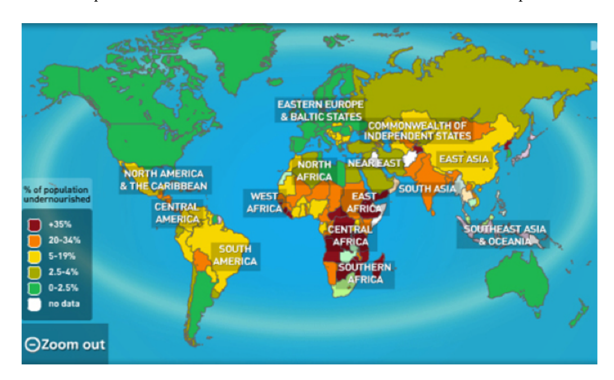
Map 1: Level of Hunger (malnutrition) by country.

to reduce food insecurity as the development community measures the term — food deprivation or undernourishment (when food intake regularly provides less than the minimum daily energy requirements). While the global percentage of those who are hungry has declined over the last decade, it remains an enormous challenge: One in about every seven people on Earth still suffers from hunger (FAO, 2010). In addition, the regions most at risk for hunger are also not geographies where the Conservancy has substantial presences: Sub-Saharan Africa, South and Southeast Asia (see Map 1).