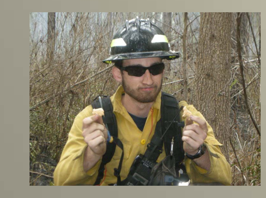
Wildland Fire Planning

Fuels related layers adjusted for known large western wildfires