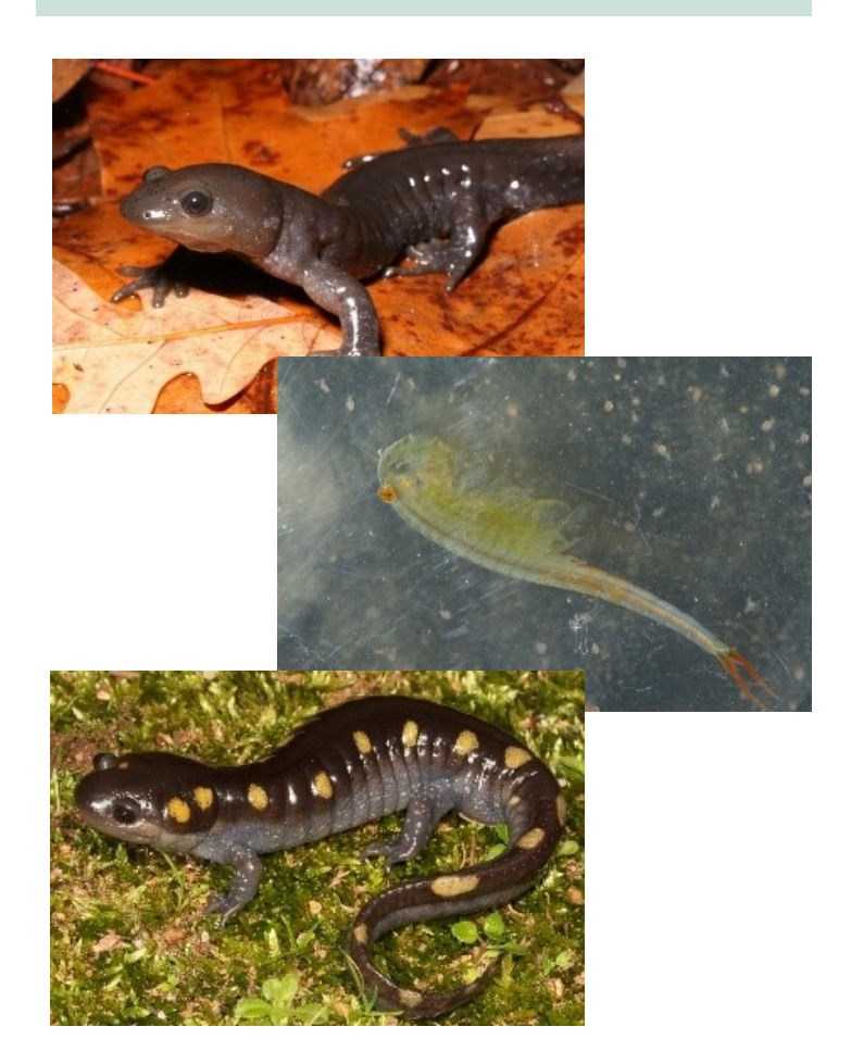
Jefferson salamanders, fairy shrimp, and spotted salamanders, all of which are obligate vernal pool species, have been found onsite.