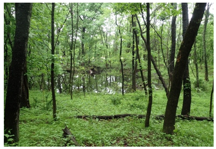
One of the existing forested vernal pools at Black Oak Wildlife Sanctuary.