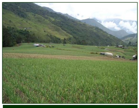
Sugar cane plantation in the Amaime watershed.

The Conservancy has helped establish successful water funds in the Ecuadorean cities of Quito, Cuenca and Zamora, as well as the Colombian capital of Bogotá. Water funds support and finance strategic conservation activities such as: