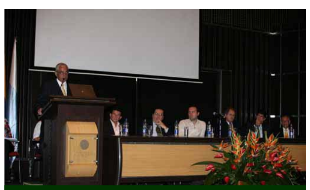
Two hundred representatives from the Colombian government, industries and grass roots organizations attended the East Cauca Valley Water Fund launching event held in the city of Cali on June 9, 2009.

This 5-year project is expected to invest US$16 million in conservation activities within the project area, including watershed protection, environmental education, reforestation, and eco-friendly