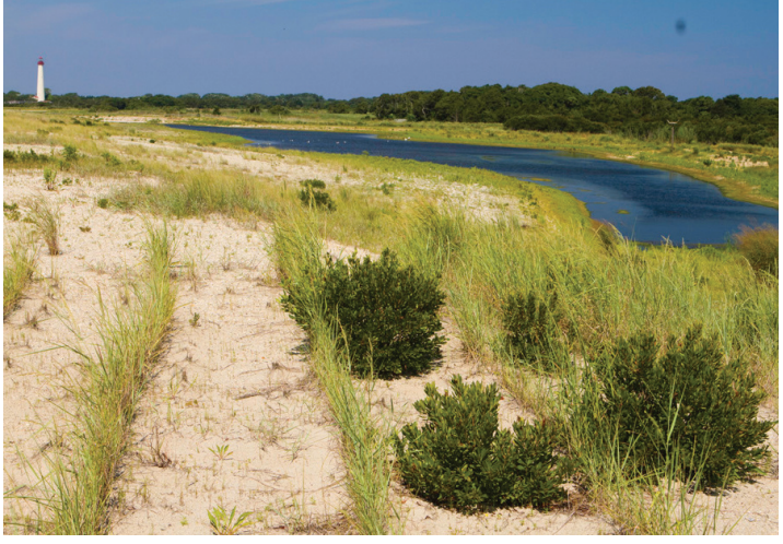
Migratory bird refuge, Cape May, New Jersey.

People live and work in these places along rivers and by the sea and have cherished their homes and traditions for generations. Many will decide to rebuild in the same vulnerable places. We now have an opportunity to rebuild smarter, taking advantage of nature's protective buffers where we can, and using lessons from storms Irene and Sandy to plan wisely for a more resilient future.