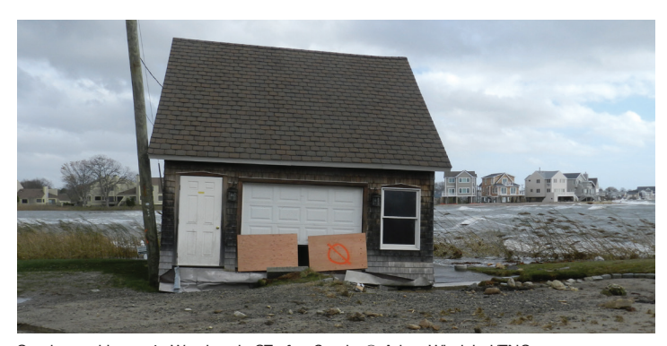
Condemned house in Westbrook, CT after Sandy.

The Nature Conservancy recognizes the challenges and trade-offs that communities face every day; addressing the issues of conservation, economic development and risk management all at once is a formidable task.