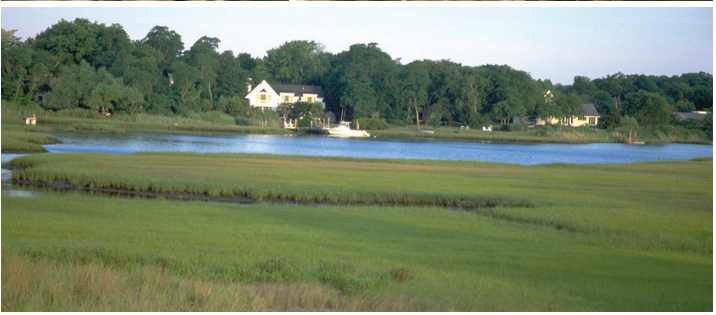
Artificial reef structures at oyster restoration site in Alabama, Gulf of Mexico. Strong roots anchor mangroves in Bahamas. Bass Creek saltmarsh at Shelter Island, New York.