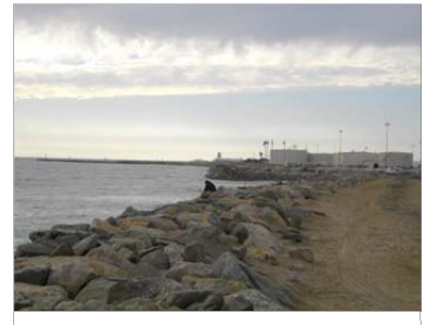
Revetments protecting Port Hueneme

Planning tools for sea level rise at the Coastal Commission's disposal are discussed below. The Coastal Commission has instituted some tools to address sea level rise today, has a few additional tools that may be refined to address sea level rise, and additional tools may be needed in the future.