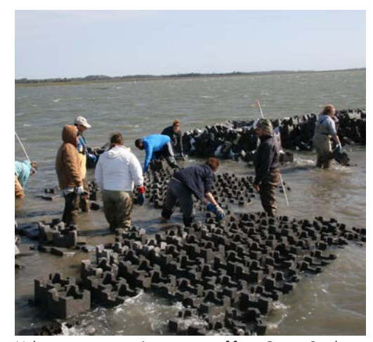
Volunteers constructing oyster reef from Oyster Castles near Box Tree.

education, outreach, and providing information to local communities to plan for sea-level rise, recurrent flooding, and storm surge. These efforts have resulting in achieving a major new milestone: The U.S. Department of Interior has awarded $1.46 million from the Hurricane Sandy Coastal Resiliency Fund to The Nature Conservancy and Climate Adaptation Working Group partners to equip coastal communities with the tools and information urgently needed to reduce the risks posed by climate-related hazards and enhance the area's natural resilience. This will be accomplished through two major initiatives: