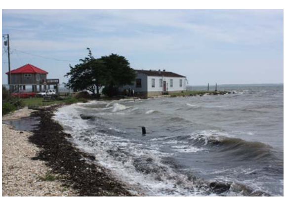
Shoreline at Franklin City.