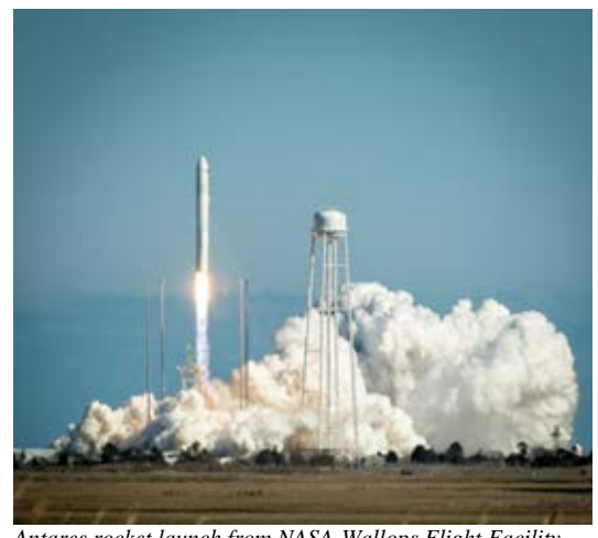
Antares rocket launch from NASA-Wallops Flight Facility.

Though rural in character, the Eastern Shore is an important economic engine in the Mid-Atlantic. The region is home to the nation's largest clam aquaculture industry, a premier NASA rocket launch facility, and extensive public lands available for recreational and ecotourism activities, including Chincoteague National Wildlife Refuge. The activities are all possible because of the Eastern Shore's unparalleled natural riches and coastal wilderness. Along its seaside runs the world's longest expanse of a naturally functioning barrier island ecosystem. This critical habitat for migratory birds and marine life has been the site of intensive scientific research over the last three decades by the University of Virginia's Virginia Coast Reserve Long-Term Ecological Research Project, which is funded by the National Science Foundation.