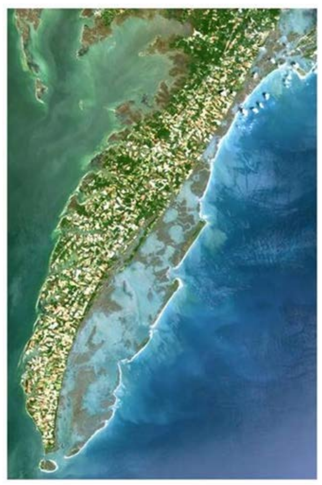
LANDSAT 7 TM image of the Delmarva Peninsula on the U.S. East Coast, 2009

Founded in 2010, the Eastern Shore Climate Adaptation Working Group, coordinated by the Accomack-Northampton Planning District Commission, is addressing this challenge through