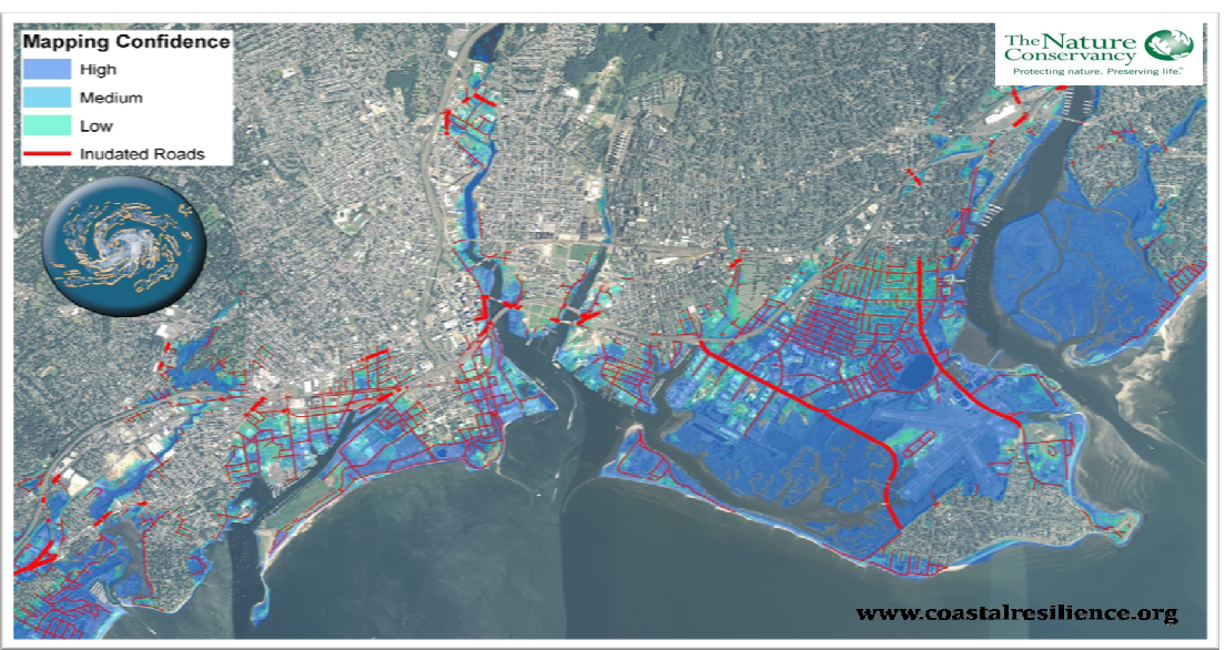
Projected flooding within the City of Bridgeport and adjoining communities during a Category 3 Hurricane (i.e., 1938 Hurricane).

The summary of finding transcribed in this report, like any that concern the evolving nature of risk assessment are proffered for comments, corrections and updates from workshop participants and other stakeholders alike. The City of Bridgeport's exemplary leadership on climate preparedness will benefit from the continuous and expanding participation of all those concerned within the community.