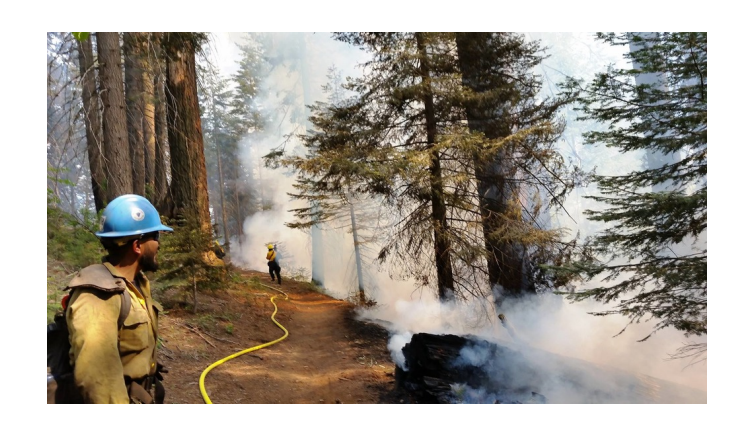
"I couldn't do my job without LANDFIRE, well. . . actually I could, it would just take me ten times as long."

QUICK SUMMARY: Given the current state of our forests, the planning and execution of prescribed burns are critically important. For five days in January 2025, nearly 150 US fire professionals met to prepare for the upcoming prescribed fire season and learn from some of the most skilled fire professionals in the country. Newly hired and experienced specialists made progress on their burn plans, learned about new tools, and gained invaluable insights from some of the