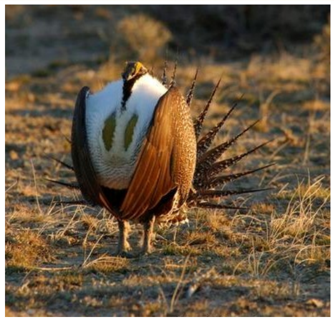
Male greater sage-grouse conducting mating behavior.

The Nature Conservancy's New Mexico Chapter (<u>https://goo.gl/RCiga5</u>) conducted a rapid landscape-scale assessment of the Upper Mimbres Watershed (https://goo.gl/a9DjRb) in southwest New Mexico which provided the foundation for developing a collaborative fire management plan. Using LANDFIRE data to assess the 535,000–acre multi-ownership area, the team calculated fire condition and modeled potential fire behavior. This information helped managers prioritize treatment areas in the assessment zone. Additionally, the Wilderness Ranger District and Silver City Ranger Districts are using the results in the Healthy Forest Restoration Act Environmental