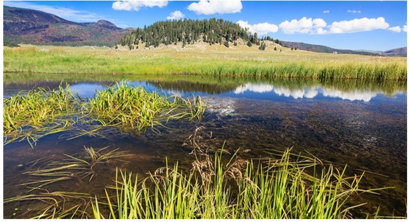
Upper Mimbres watershed in the Jemez Mountains, New Mexico where officials used LANDFIRE data to prioritize restoration and treatment efforts.

LANDFIRE provides landscape-level vegetation and habitat data that scientists use to interpret sage-grouse movements and habitat use across the West. Through evaluating