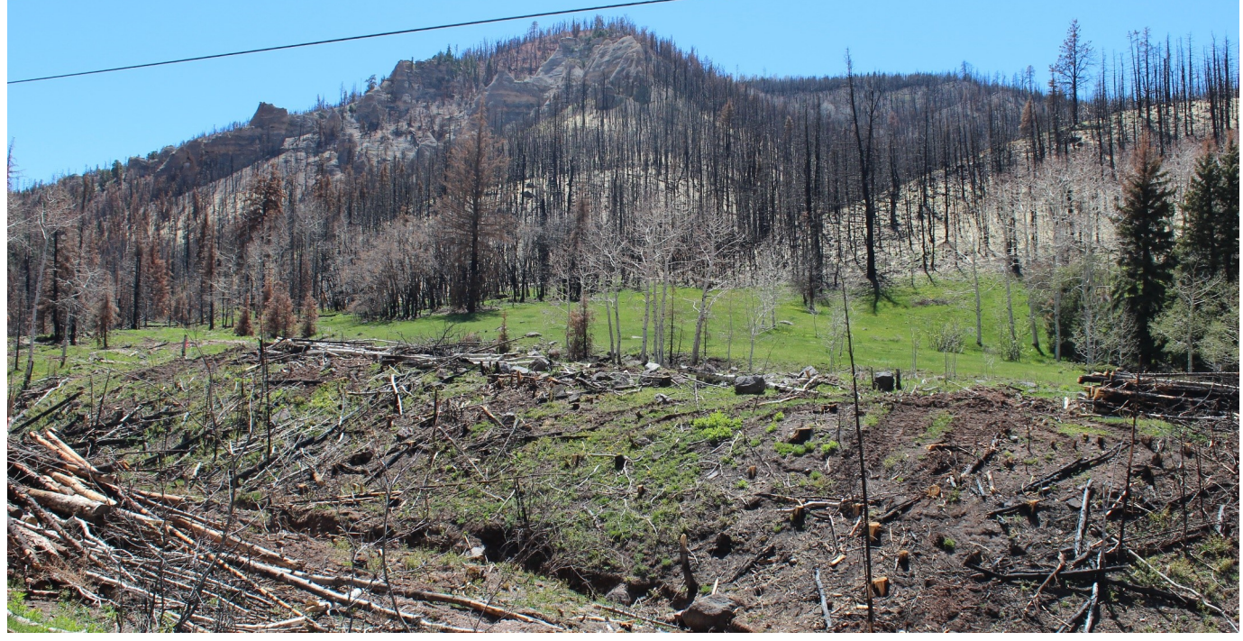
Brian Head Fire recovery zone.