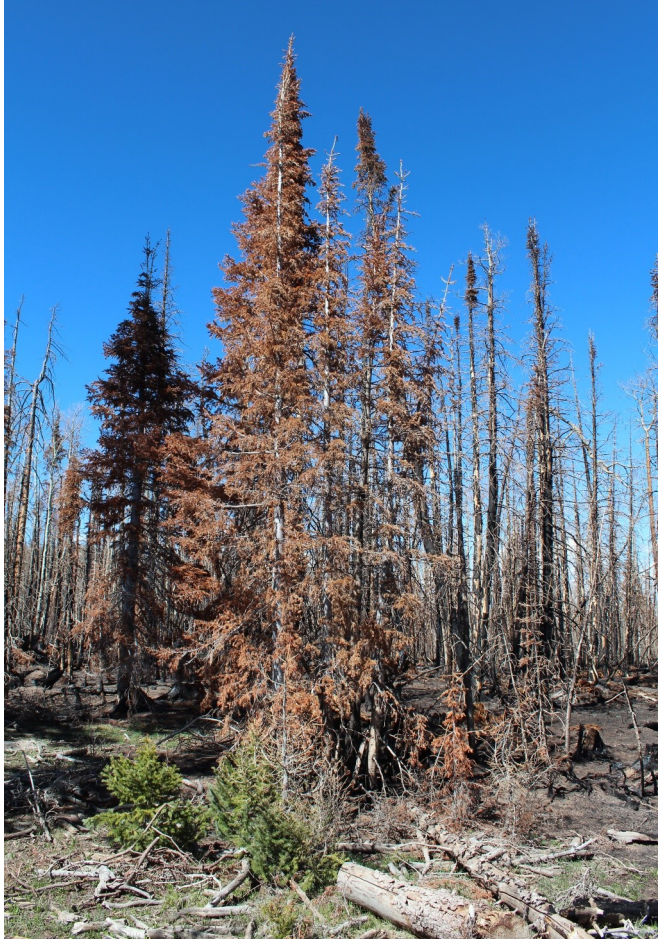
Results of Brian Head Fire.

Yocom (and other climate scientists) predict that as climate change continues to impact habitat suitability, species are likely to migrate uphill where temperatures are better suited for preferred (colder) growing conditions. Yocom will test if this is true for regenerating tree species that occur on the Brian Head Fire site.