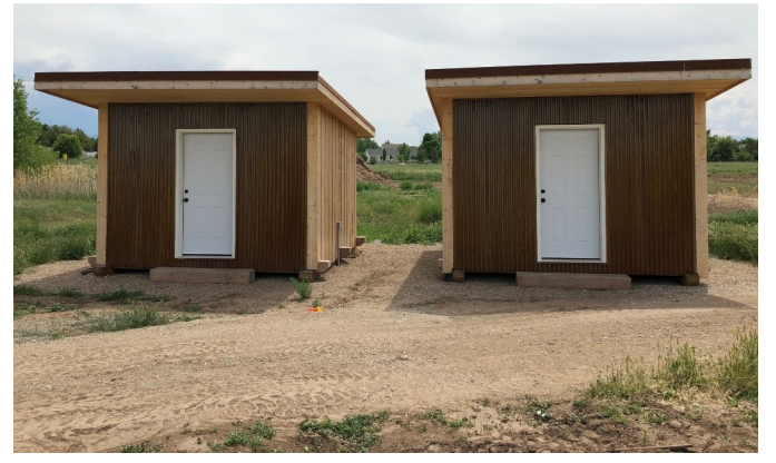
Two sheds involved in an experiment at USU Botanical Center, Kaysville. Shed built with CLT is on the left.

The Utah Botanical Center, in cooperation with Euclid Timber Frames, have built a set of nearly identical sheds that are designed to challenge the building codes in Utah related to cross-laminated timber construction (CLT). CLT is a material made by sandwiching layers of perpendicularly oriented boards that are fused together. What makes CLT unique is its ability to utilize undervalued, small diameter timber and create massive wood walls that fit together like pieces of a puzzle.