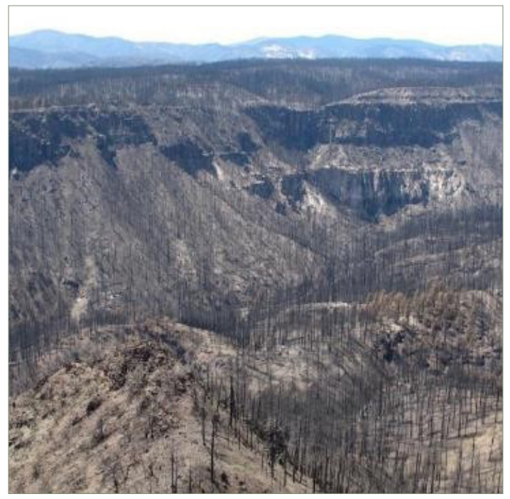
In 2011, the Las Conchas Fire burned across lands managed by multiple federal agencies, as well as tribal, state, county and private lands. BAER was undertaken separately by each jurisdiction.