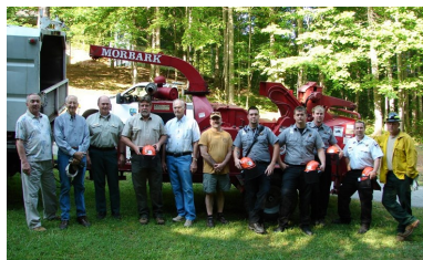
Residents of a Fire Adapted Community join agency staff for a fuel reduction work event.