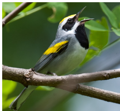
Golden-winged Warbler. Prescribed burning is improving habitat conditions for the last remaining population of this bird in Georgia.