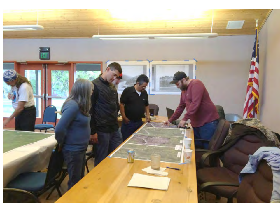
Workshop participants compare historical and current imagery of the landscape

For more information about the Indigenous Peoples Burning Network, contact: