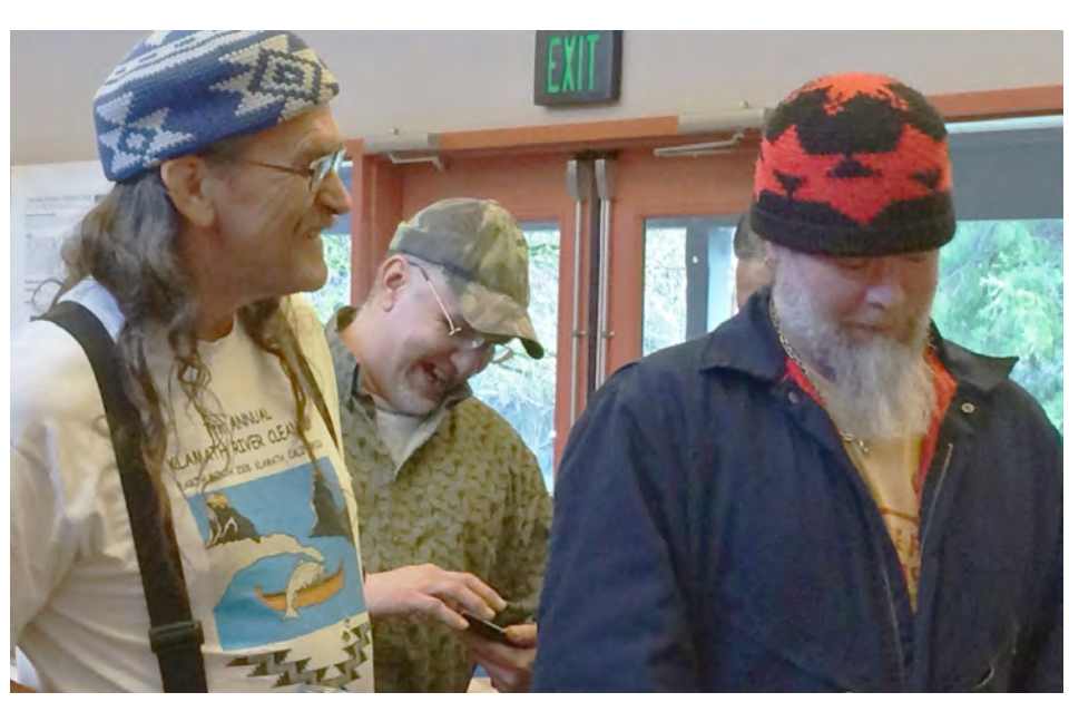
The Yurok Tribal Chairman ( left ) exchanges ideas with other network participants.