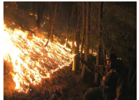
Brock Luedthe having some late night fun. This unit was actually brutal on the lighters.