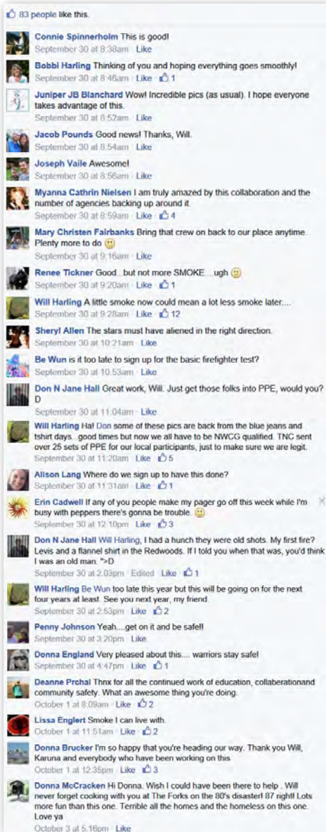
Comments on MKWC September 30 posting

The Klamath Prescribed Fire Training Exchange took place October 1-11, treating lands near and between communities along the Klamath River in northern California. The Mid Klamath Watershed Council (MKWC) led the social media way with great daily (or nightly) updates about TREX burning—and got good community response from the residents of an area that spends much of each summer smelling the smoke of wildfires.