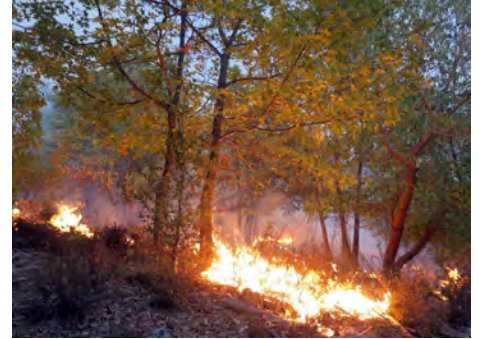
Making fresh deer browse in a masticated black oak/madrone stand.

All photos in here are from the MKWC Facebook page.