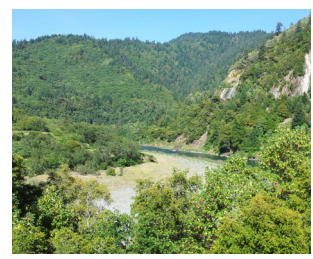
TREX are conducted in a wide range of landscapes, with a variety of ecological and social goals. In Nebraska this spring, burns restored and maintained prairie and reduced woody encroachment on rangeland. On the coastal plain of Virginia, underburns were conducted to maintain longleaf pine habitat. In northern California mountains, burning reduced hazardous fuel loads and rejuvenated cultural resources.