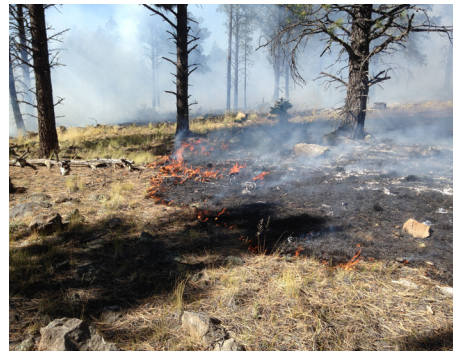
Black Lake burn