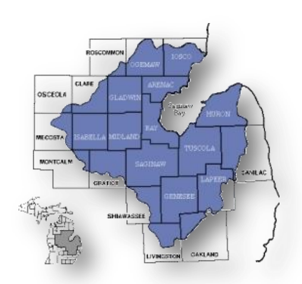
The Saginaw Bay watershed is Michigan's largest.

The Saginaw Bay watershed is the largest in the state of Michigan, spanning 5.5 million acres and 22 counties. The ecological health of Saginaw Bay and its tributaries is critically important to not only Lake Huron, but the entire Great Lakes ecosystem, supporting a diversity of fish, migratory birds, and other wildlife. It has the largest concentration of coastal wetlands in the Lake Huron Basin and serves as Lake Huron's most important source for several fish species, including walleye, and is home to some of Michigan's most productive farmland. One of the most significant drivers of change to coastal and inland freshwater habitats throughout the Saginaw Bay watershed is fertilizer and sediment entering rivers and lakes due to