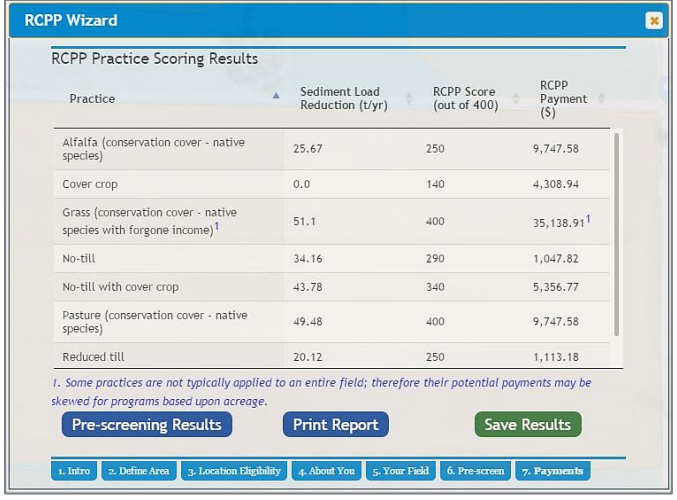
Fig 3: Pre-Screening Results