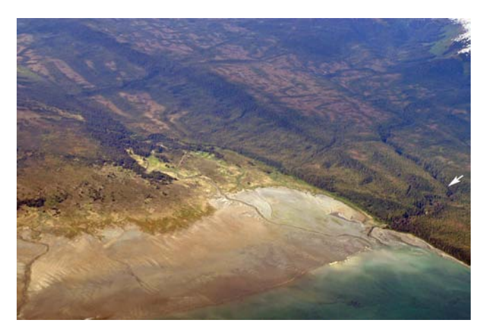
FIG 5. Southeastern corner of the Gustavus flats at low tide. The Gustavus Foreland is a giant outwash lobe deposited when ice sat on the Little Ice Age terminal moraine in the mid-1700s. The Nature Conservancy recently acquired lands on the forelands to protect its conservation values. Falls Creek (arrow) drains a low, boggy bench above the Foreland, dropping through a canyon in its final descent to the beach. This is the site of a hydropower project under construction that will provide electricity to Gustavus.

associated with anadromous fish (Chapter 2, Table 12). Eighty-five percent of riparian forests with anadromous fish values are protected in watershed or sub-watershed reserves. Conservation is the long-term priority for fish and wildlife habitats in this province. Perhaps the major concern in the future would be potential impacts from industrial tourism.