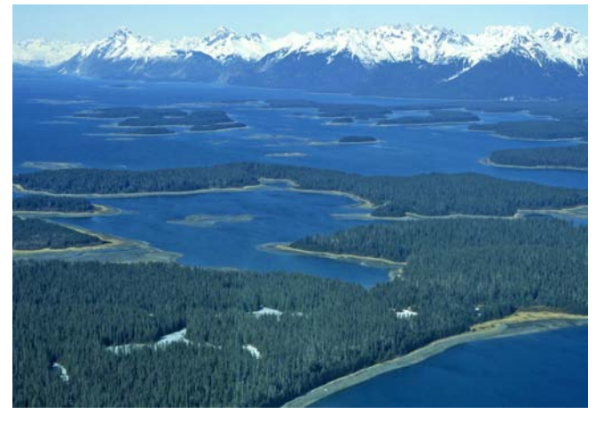
FIG 3. Looking north over Lester Island in the Beardslee chain. These 150 year-old forests grow on recently deglaciated till and outwash. In spite of their youthfulness, they would probably qualify as "large-tree" if the park had been covered in the USFS TIMTYP layer. Northward from the Beardslees into Glacier Bay, tree size declines rapidly. Eventually, conifers and even woody shrubs (Fig 4.3.2) drop out.

penultimate glacial advance. The ice mined away the coarse surroundings, turning the former concavities into convexities (Fig 3).