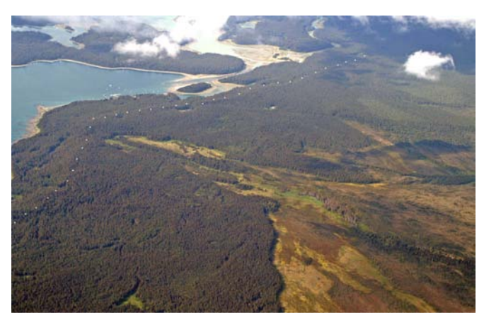
FIG 4. Dotted line traces the moraine deposited at the peak of the Little Ice Age in Bartlett Cove. The large alluvial fan spreading towards the lower right was formed when ice still sat on this moraine. It originates in a pass called Cooper's Notch. This and several other giant fans coalesced to form the Gustavus Forelands.

The climate of this area is drier than most regions of Southeast. Glacier Bay receives 70 in (178 cm) of precipitation and 110 in (279 cm) of snowfall annually. The mean January and July temperatures are 27.9 and 55.7 deg F (-2.3 to 13.2 deg C), respectively.