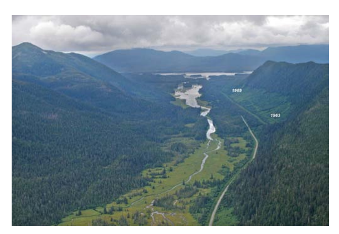
FIG 4. View northwest at Blind Slough, Mitkof Island. Productive south-facing wind forest on colluvial toeslopes was logged in the 1960s.

Forest types, historical logging, and roads are mapped within the Kupreanof / Mitkof Province in Figure 6. Refer to the Arc Reader GIS database in Appendix C of this report to review detailed mapped information on location of large-tree stands, past timber harvest, roads, forest reserves, protected areas, and regions of core ecological values.