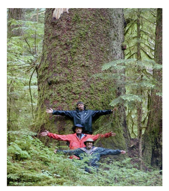
FIG 5. Landmark Tree on Castle River. It was 8.2 ft (2.5 m) in diameter at 10 ft (3 m) above the ground. This tree and a neighbor were roughly equal in size to the official state record spruce on Prince of Wales Island.