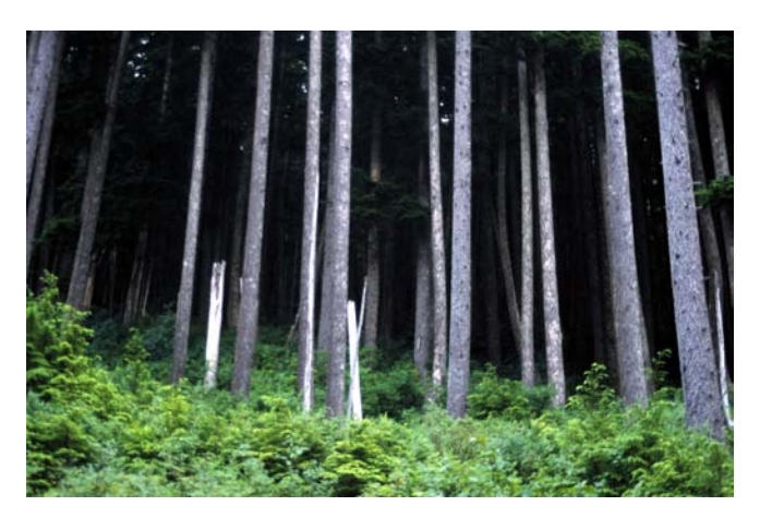
FIG 3. Highly productive 200-year-old "wind forest" on exposed south-facing slope above Bear Creek, Mitkof Island. Even-sized trees indicate a mature but not old-growth forest, recovering from a stand-replacing disturbance. On Mitkof, such forests have produced some of the highest timber volume measured on the Tongass—much higher than the best large-tree alluvial Landmark Tree stands that appear to "plateau" at about 140,000 board feet per acre. Mitkof never had much large-tree bottomland forest, and timber harvest here has targeted primarily these south-slope wind forests.

East Chichagof and Baranof. But it has likely contributed to reduced winter carrying capacity for deer. Although only 16% of the original POG has been logged a conservative estimate indicates that nearly half of the large-tree forest has been logged in this province (Chapter 2, Table 5). Only 15% of the remaining large-tree old growth occurs in watershed-scale reserves and 45% occurs in the timber base.