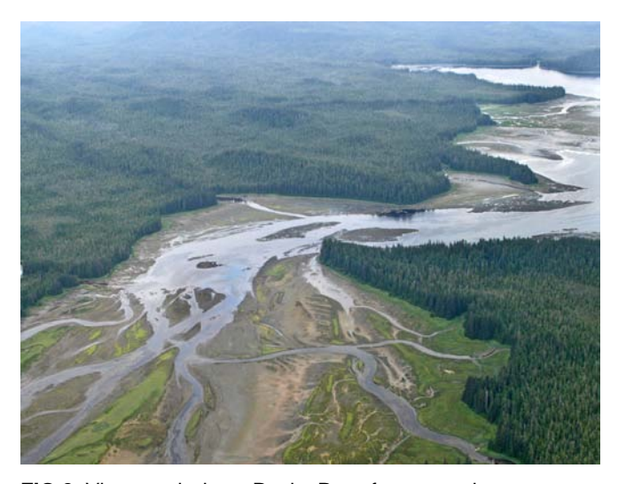
FIG 2. View south down Rocky Pass from over the entry to Big John Bay. The low plateau is composed of mudstones and conglomerates formed during the Age of Mammals, some of the youngest sedimentary rock in Southeast. The rocks bear imprints of deciduous leaves from a time when the land was covered by a forest similar to that of the Appalachians today. This flat country, and the similarly lowlying volcanic landscape to the south on either side of Rocky Pass, generally has little large-tree forest and has not been heavily impacted by logging. One positive consequence of the convoluted shorelines and low relief-which extends into the bathymetry-is extensive salt marsh and mudflat formation. Of the 25 largest estuaries in Southeast, five are within a short skiff ride of Kake. This is remarkable considering that none of them were created by large rivers.

while the "treads" are covered in scrub forest and peatlands. Only the steep slopes have economically valuable timber, but these areas often erode badly after canopy removal. Even uncut forests have actively gullied slopes that send high bedload sediment into streams (Nowacki et al. 2001). Perhaps this helps to explain the high frequency and relatively large size of estuaries in this province, as noted below (Fig 2).