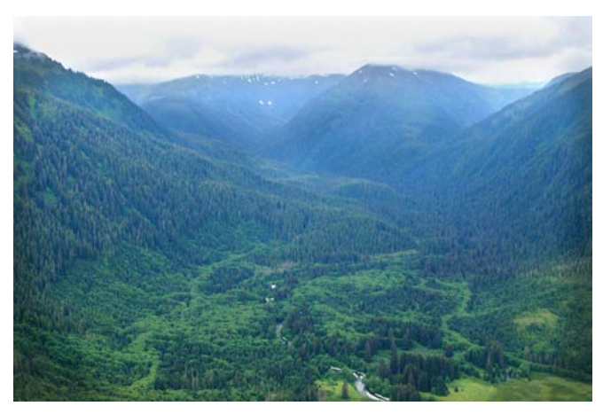
FIG 5. Flood-plain and colluvial toe-slope logging in Saook Bay, northern Baranof. Valley-bottom large-tree removal was the norm for both East and West Baranof provinces. Although this cut is 44 years old, conifer regeneration has been delayed by "alder capture." This happens when tractoryarding disturbs the soil, allowing heavy seed reproduction by red alder. The resulting mixed conifer/deciduous forests are much better summer habitat than are young pure conifer stands. But the stream is now exposed to summer overheating, and will lack large woody debris for centuries until the forest regrows.