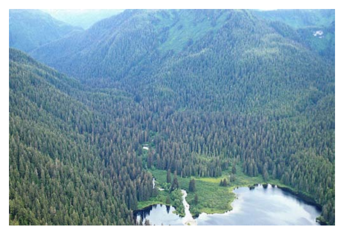
FIG 2. The head of Lake Eva has 380 acres (154 hectare) of mapped large-tree forest, one of the last large bottomland spruce stands in East Baranof Province. Lake-head alluvial deposits offer some of the best remaining prospects for finding Landmark-quality forests because some remote lakes have not yet been roaded and logged. Comparable large-tree stands in coastal bay-heads were more accessible to logging, and few remain (Fig 4).

Sixty-three percent of riparian forests associated with anadromous fish occur in development lands (some of these have riparian buffers).