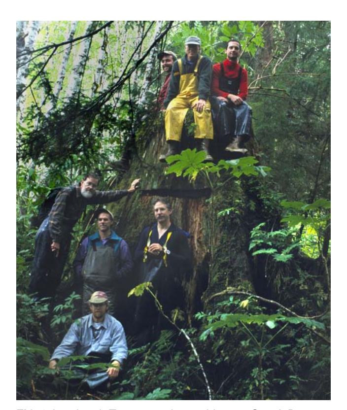
FIG 4. Landmark-Trees crew in an old cut at Saook Bay, west of Lake Eva. The long springboard cut was made with chainsaw rather than axe, indicating fairly recent logging. The "managed stands" database gives a date of 1962 for this 610-acre (247 hectare) clearcut above Paradise Flats. Stumps like these allow researchers to reconstruct the quality of the original forest. It closely resembled the remnant forest on Indian River. An oblique view of the clearcut is in Fig 5.