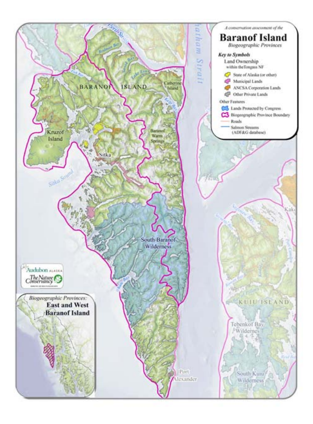
FIG 1. East Baranof Province.

During the Great Ice Age, the tall mountain massif of northern Baranof became a center from which glaciers radiated, flowing east into Chatham Strait and west to the Pacific Ocean. Today, the East Baranof Province (Fig 1), with adjacent portions of West Baranof, is the highest and most rugged of all island topography in Southeast. Ice-age glaciers carved deep U-shaped valleys with oversteepened walls that remain unvegetated to this day. Mountain elevations range from 4,600 ft (1,400 m) above Glacial River in the north, to the 4,528-ft (1,380 m) horn of Mount Ada on the south. These summits are about the same elevation