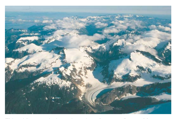
FIG 3. View south down the spine of eastern Baranof from over Kelp Bay. Resembling the mainland icefields, this is the most glaciated and dramatic portion of the Southeast island chain. Precipitation wrung from the clouds here creates a rainshadow at Angoon on Admiralty Island to the east.

Forest types, historical logging, and roads are mapped within the East Baranof Province in Figure 6. Refer to the Arc Reader GIS database in Appendix C of this report to review detailed mapped information on location of large-tree stands, past timber harvest, roads, forest reserves, protected areas, and regions of core ecological values.